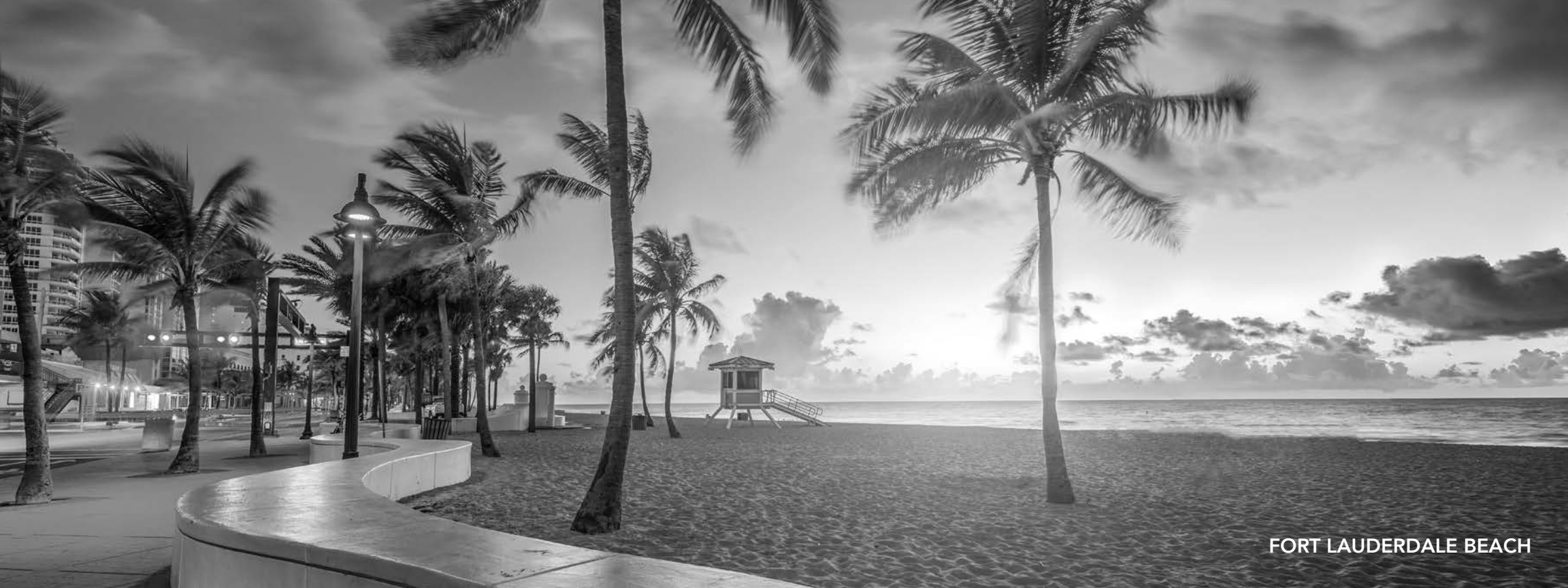
FORT LAUDERDALE BEACH