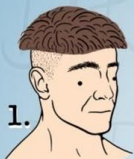
1. YouTube lied to me