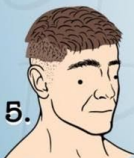
5. "Sick fade bro!"