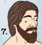
7. Christ has risen!