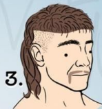
3. "I'm never gonna financially recover from this"