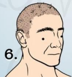
6. The Wife had a go..