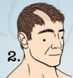
2. Cheap clippers broke