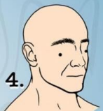
4. The Crystal Maze