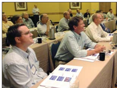
Attendees at the 2009 event in Kansas City listen to a presentation on the effects of climate change regulation.

board members, friends, and agribusiness colleagues interested in hearing from industry experts on hot-button topics affecting the global food and agriculture environment.