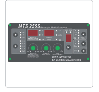
Digital Panel for Full Control