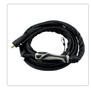
Includes 4m WP26 TIG torch