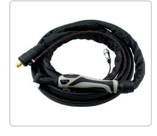
Includes 4m WP26 TIG torch