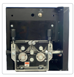
4 Roll Geared Wire Feed