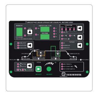
Digital Panel for Full Control