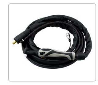
Includes 4m WP26 TIG torch