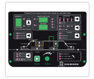
Digital Panel for Full Control