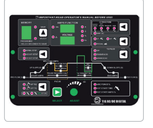
Digital Panel for Full Control