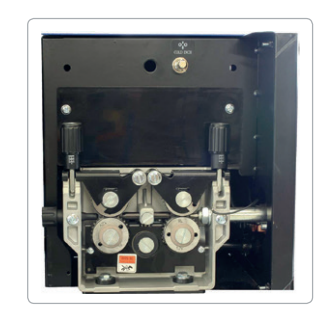
4 Roll Geared Wire Feed