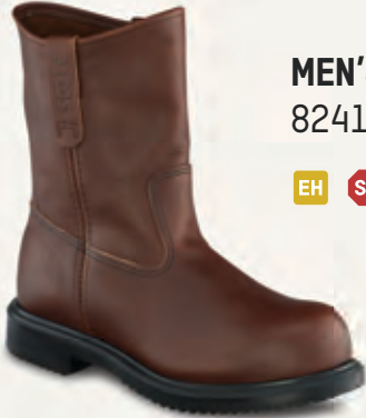
MEN'S 9-INCH PULL-ON BOOT 8241