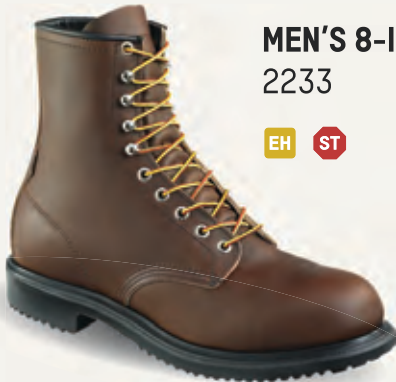
MEN'S 8-INCH SAFETY TOE BOOT 2233