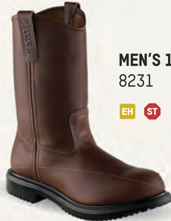
MEN'S 11-INCH PULL-ON BOOT 8231