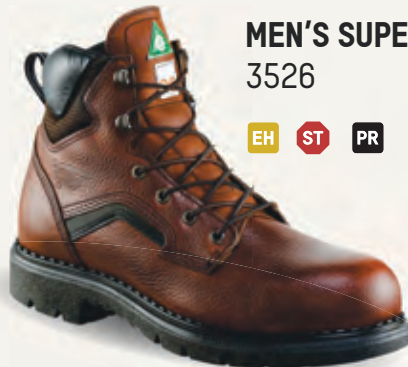
MEN'S SUPERSOLE® 6-INCH BOOT 3526