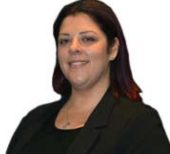
PEOPLE AND CULTURE & WOMENS FOOTBALL