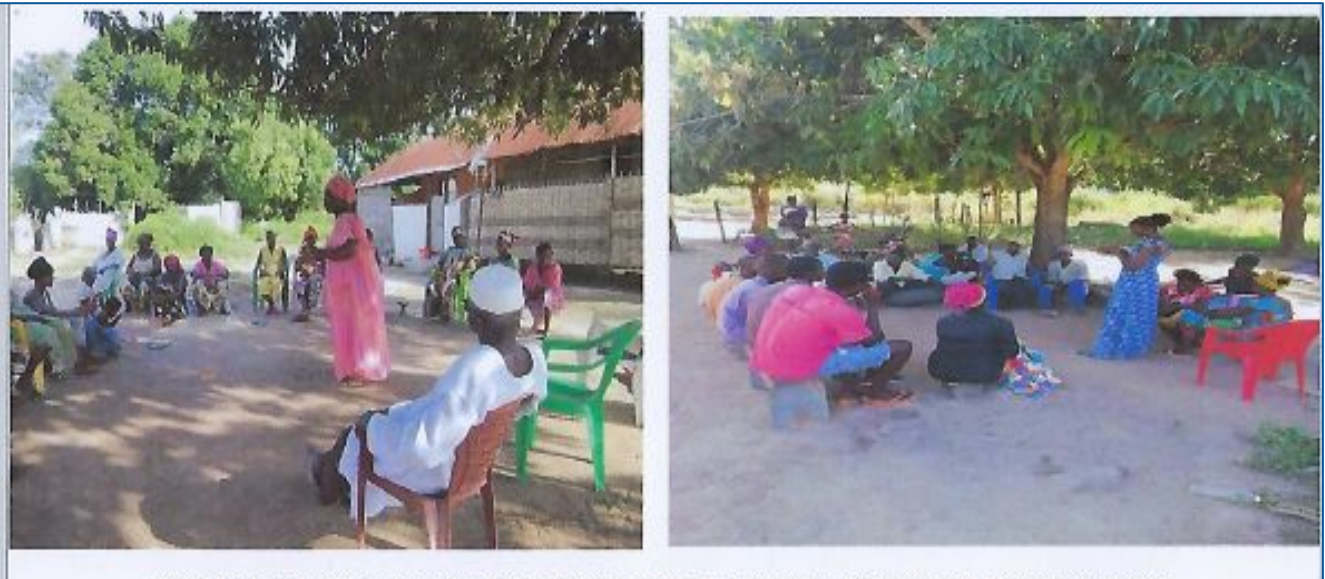
Sessão de sensibilização e consciencialização na Comunidade de Bairro 2-Tenquinam/Bambadínca e Sintcham-Cullel/Xitole

With UNFPA's support, the Institute for Women and Children, within the framework of 16 days of activism in Reno District, sensitized people on GBV, SRH, human rights and the prevention of COVID-19. About 300 people, including government representatives and UNHCR participated, and 200 dignity kits were distributed at the event.