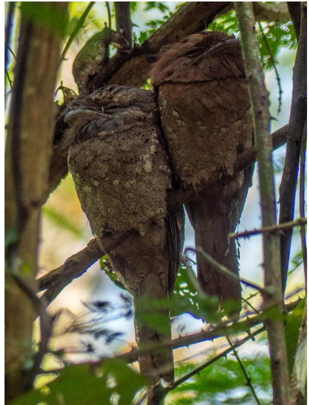
Sri Lanka Frogmouth Pair

https://ebird.org/india/checklist/S63418562