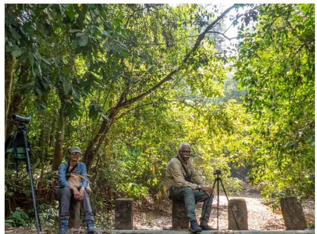
Waiting for Kingfishers