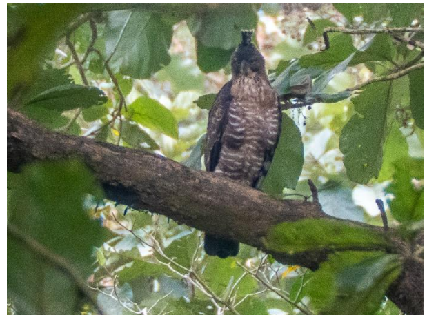
Legge's Hawk Eagle

We returned to a similar area as the previous afternoon for our final Periyar birding. We noted an impressive flock of 51 Malabar Starlings in one tree where we had seen some gathering the evening before, and they had presumably roosted there. A very orangey-brown Indian Scops-Owl roosting, either a particular colour morph or the not always recognised subspecies malabaricus , was nice to see, and confused our guide as he made the opposite identification error as the day before, identifying this one as Oriental Scops! We saw what was probably yesterday's Greater Spotted Eagle again, another Heart-spotted Woodpecker, more White-bellied Treepies and a Rusty-tailed Flycatcher. Finally, just before we left, we had stunning views of a perched adult Legge's Hawk Eagle.