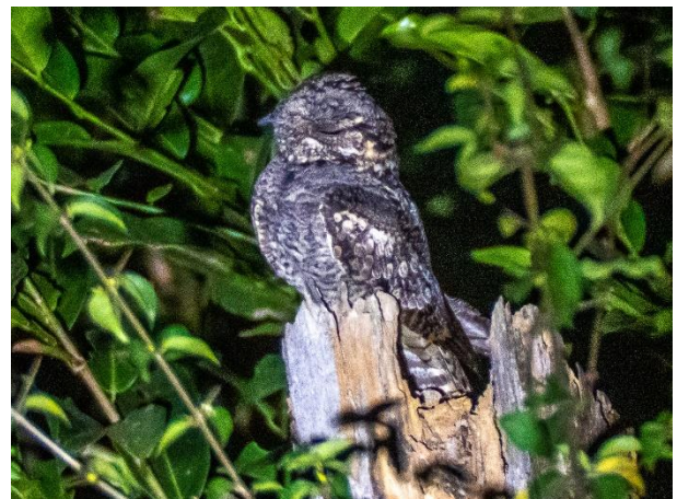
Indian Jungle Nightjar