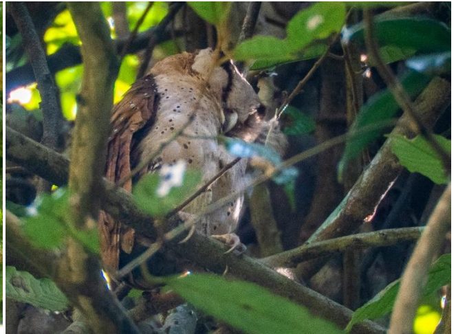
Sri Lanka Bay Owl