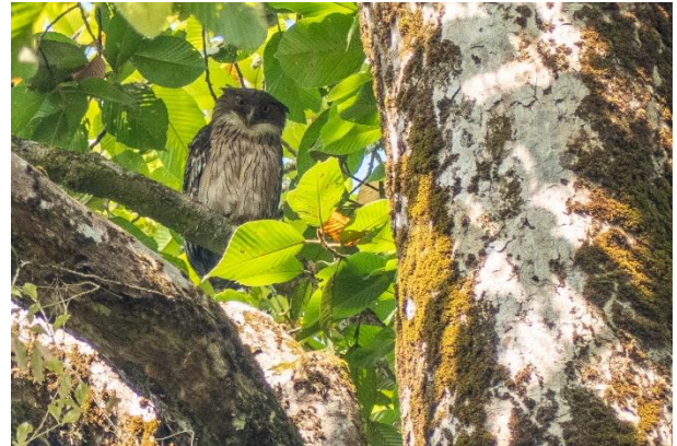
Brown Fish Owl

Shortly afterwards and we were all watching a superb Sri Lanka Bay Owl, roosting above our heads, a definite highlight of the entire tour. It was a little obscured with either a feather or a leaf in front of its face from whichever angle we could view it from, so the group of photographers who were just leaving were quite disappointed, but we were absolutely elated!