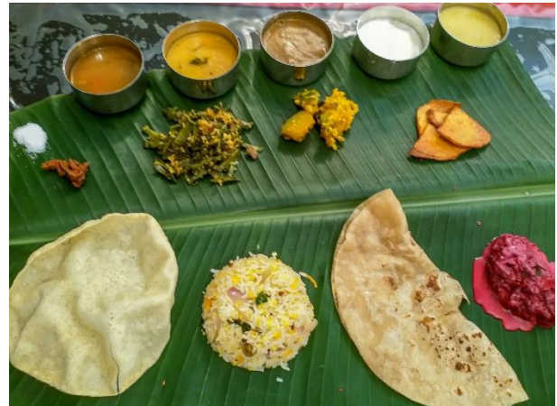
South Indian Meal

We arrived at the Banyan Tree Farm Stay near Top Slip in time for a luxurious version of the traditional South Indian thali meal, served on a banana leaf. After this we drove to Top Slip where we were told at the Forest Department reception that birding is not allowed in the afternoon! Unfortunately, illogical restrictions are quite commonplace in India. We drove further on, across the Kerala border, to the Parambikulam Tiger Reserve reception to try our luck there – it is all one large contiguous forest, administered separately for each state – but met with the same result. This time we were given a whole host of excuses including all the guides being busy in the forest with other groups, and there only being one lady naturalist available and she doesn't want to come! Reluctantly we had to spend our time just birding around the Headquarters and along the road nearby. This was actually quite good though, once we had got away from the tourists who were watching Nilgiri Langurs and calling them Lion-tailed Macaques! We had good views of Blue-faced Malkoha, Brown-capped (Indian Pygmy) Woodpeckers, noisy Greater Racket-tailed Drongos, Asian Fairy Bluebird, and some lovely Flame-throated Bulbuls.