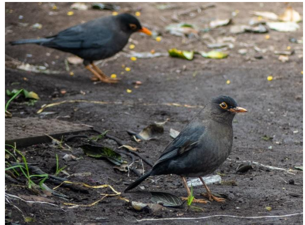
Male and Female Indian Blackbirds

A short stop at a site where Mike had seen both Painted Bush Quails and Nilgiri Pipits in September was unsuccessful in that respect, but a small flock of Tickell's Leaf Warblers feeding low down in tea bushes was very nice to see.