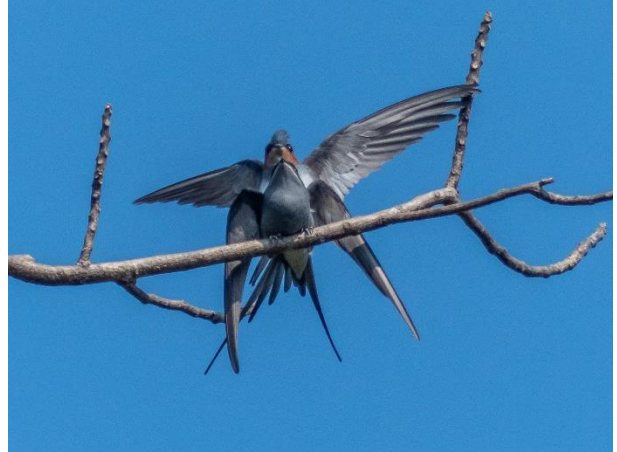
Mating Crested Treeswifts

Leaving Top Slip, we drove into Kerala and broke our journey in the drier scrub forest of Chinnar Wildlife Sanctuary. After another traditional South Indian lunch, unimaginatively known as 'meals' here, we trekked through the park for the afternoon. This was excellent, with the different habitat producing several species we did not encounter anywhere else on the trip, and plenty of bird activity throughout. Grey-bellied Cuckoo was heard calling immediately we arrived, and we had good views of this difficult to find species. A displaying pair of Black-winged Kites, rising and falling together in flight, was a lovely sight, and more breeding activity was in evidence with a pair of mating Crested Treeswifts. Bay-backed Shrike was another typical bird of dry scrub habitat that we knew we wouldn't find elsewhere on the trip, and Jungle Prinia was also good as they tend to be silent and quite secretive outside of their monsoon breeding season. Here we also saw White-bellied Drongos, and the first of several Brown-breasted Flycatchers for the trip.