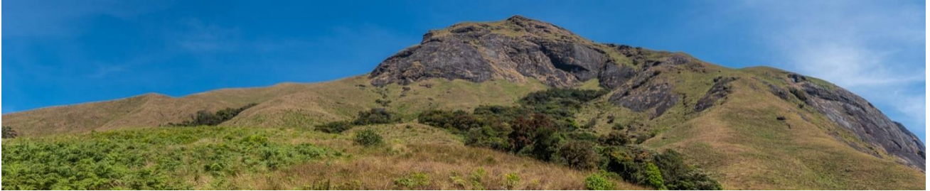
Eravikulam National Park