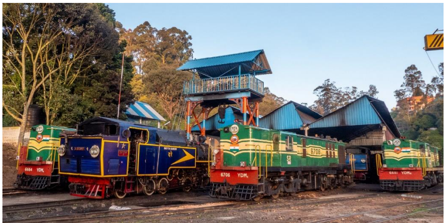
Nilgiri Mountain Railway

The following day we left early to pick up Katie who had just arrived in Coimbatore. We couldn't resist a stop on the way though at the fascinating Coonoor railway station of the Nilgiri Mountain Railway, where we were able to wander around the steam locomotive shed to check out the wonderful engines that still run on this metre gauge line, built by the British and opened back in 1899. The Nilgiri Mountain Railway is part of the UNESCO World Heritage Site of Mountain Railways of India, along with the Darjeeling Himalayan Railway and the Kalka – Shimla Railway, and, for train aficionados, is the only rack-and-pinion railway in India.