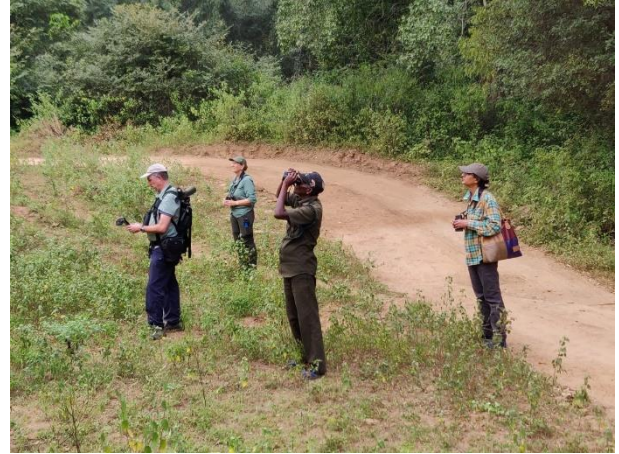
Birding at Periyar

A noisy Heart-spotted Woodpecker gave us great views: it's very thin neck and tall crest, and short tail, gives it a shape quite unlike anything else, and it is always a delight to see. Another overhead eagle proved to be a Greater Spotted, and further looking vertically up showed some extremely high swifts: mostly White-rumped Needletails (or Spinetails) but with one briefly seen Brown-backed Needletail. All unfortunately were so high and briefly in view that we were left quite unsatisfied! As we returned near the end of the walk, we decided to investigate a slightly marshy field, and found many Pin-tailed Snipes. Strictly speaking they were Swinhoe's or Pin-tailed, as these two are not reliably distinguishable in the field – we did try to get views of the spread tail as they flew at close range, but as usual couldn't make anything out!