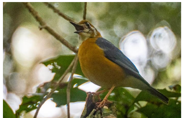
Singing Orange-headed Thrush

https://ebird.org/india/checklist/S63353433