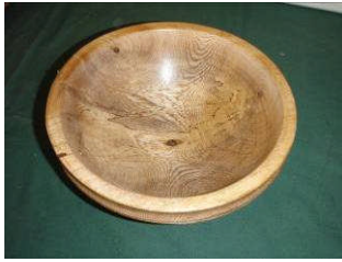
Sid Churchward Bowl Rubber Tree; Friction polish