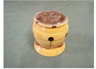
Erich Aldinger Music Box Gidgee; Finish 7008