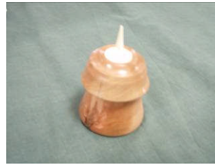
Erich Aldinger Lidded Box Melaleuca with Bone