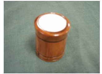
Erich Aldinger Lidded Box Claret Ash with Bone