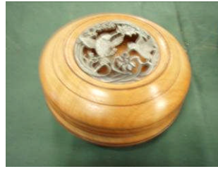
Sid Churchward Potpourri container Muranti; Friction polish