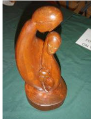
Fred de Jonge Carving Cedar