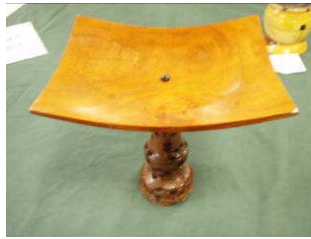
Erich Aldinger Platter & Stand Banksia & NG Rosewood