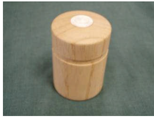
Erich Aldinger Lidded Box Melaleuca with Bone