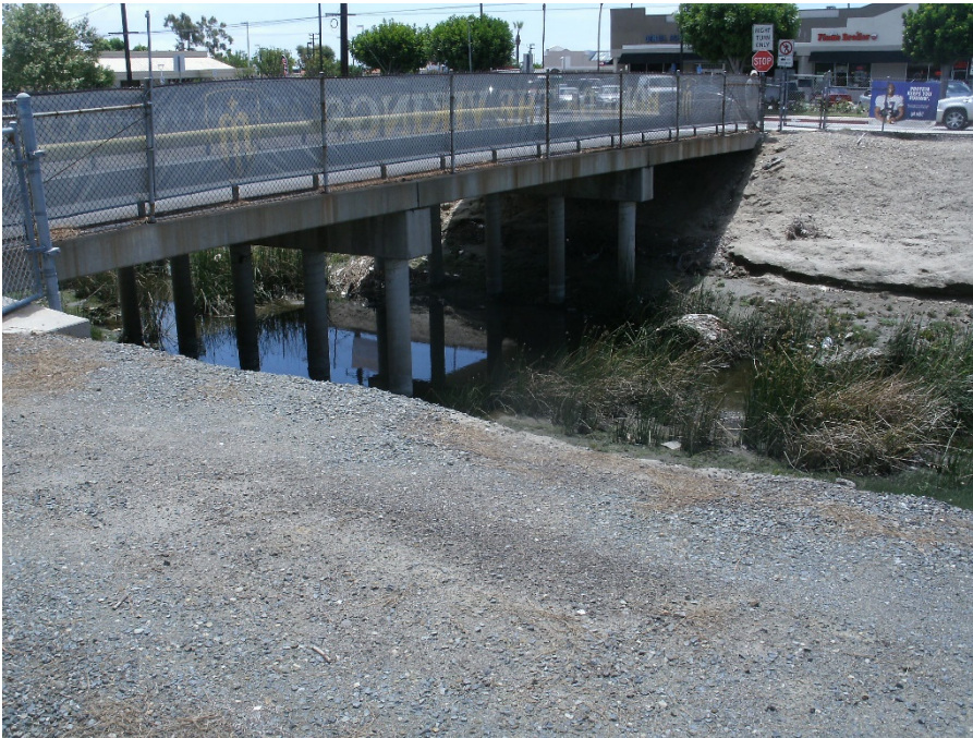
Photo 5: Facing southeast at bridge crossing to Marina High School toward Edinger Avenue across C04 Reach 20.