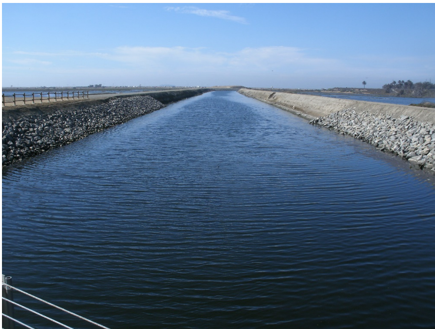
Photo 2: Facing downstream on C05 Reach 1 from pedestrian bridge on the northeast end of the adjacent pocket marsh (right) towards Bolsa Bay.