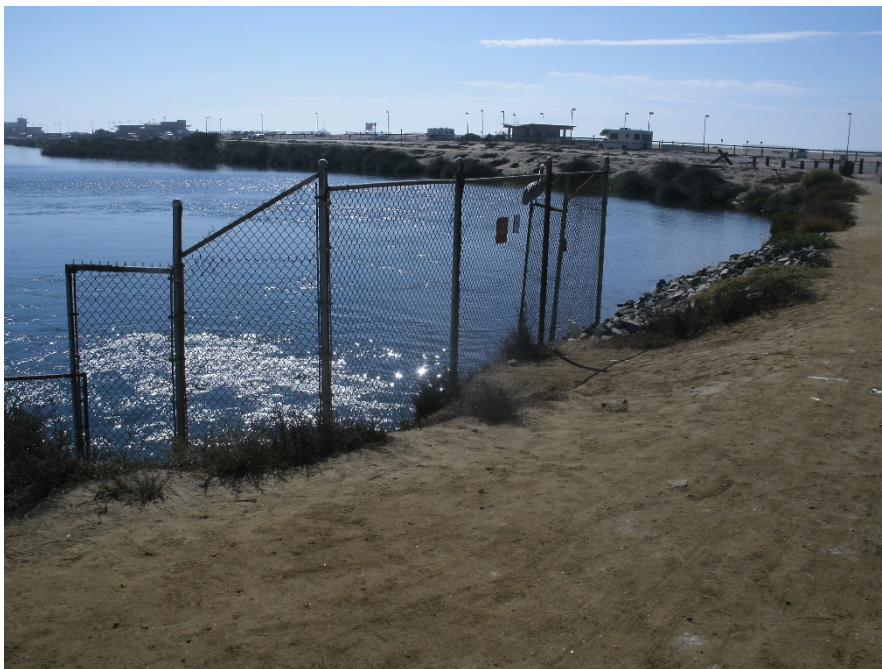
Photo 4: Facing towards Inner Bolsa Bay at culvert between Inner and Outer Bolsa Bay.