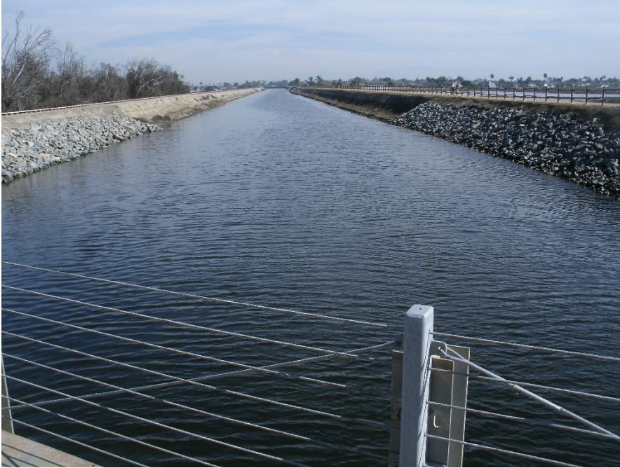
Photo 1: Facing upstream on C05 Reach 1 from pedestrian bridge on the northeast end of the adjacent pocket marsh.