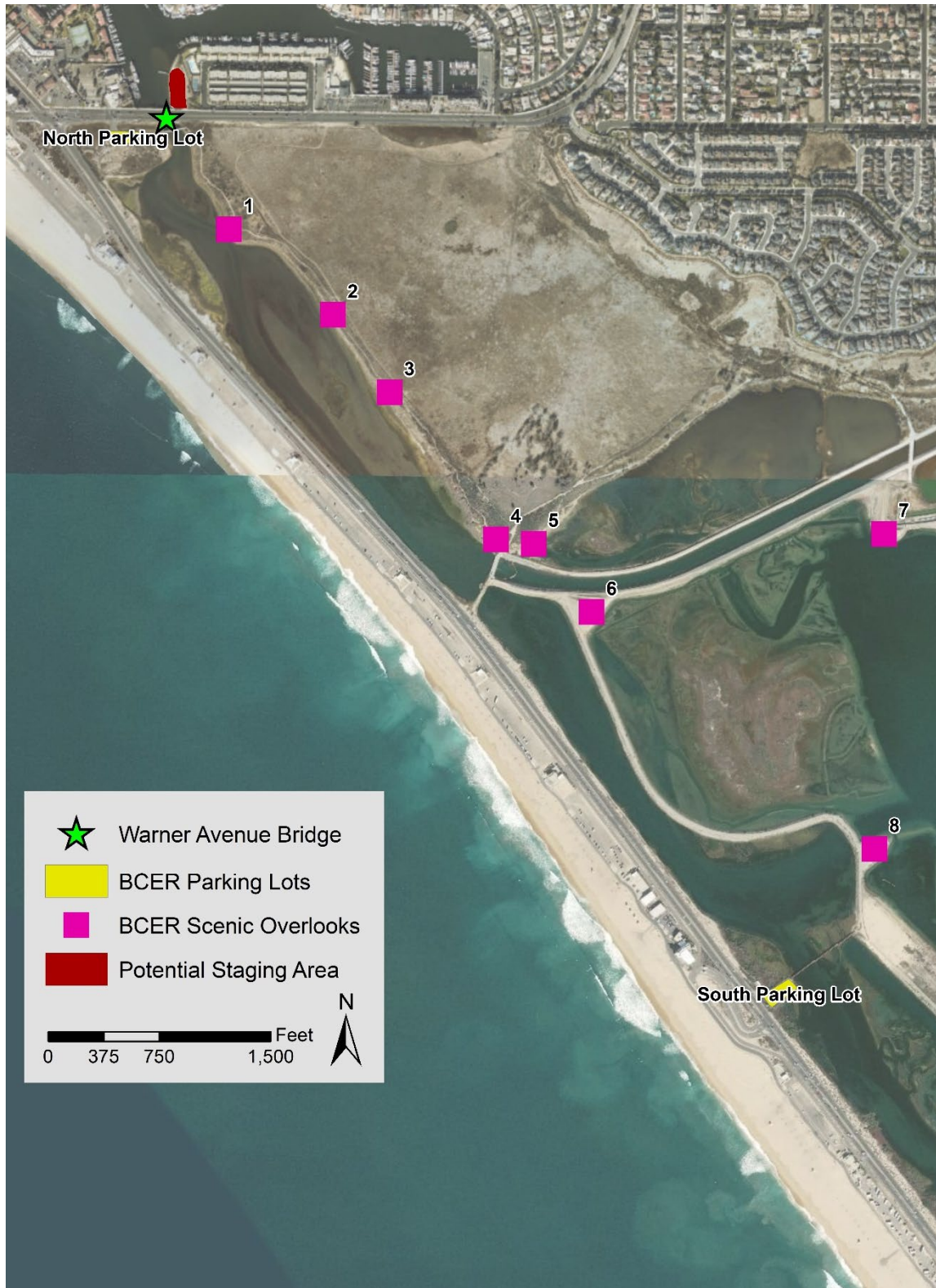
Figure 3: Location of Scenic Overlooks within the Bolsa Chica Ecological Reserve