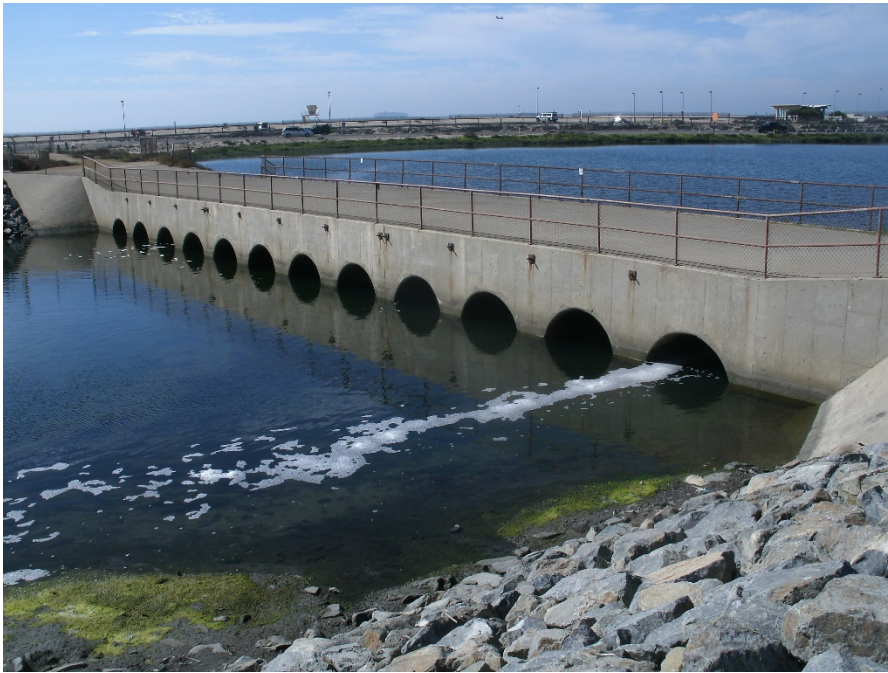
Photo 3: Facing downstream on C05 Reach 1 at the one-way tide gates towards Outer Bolsa Bay.