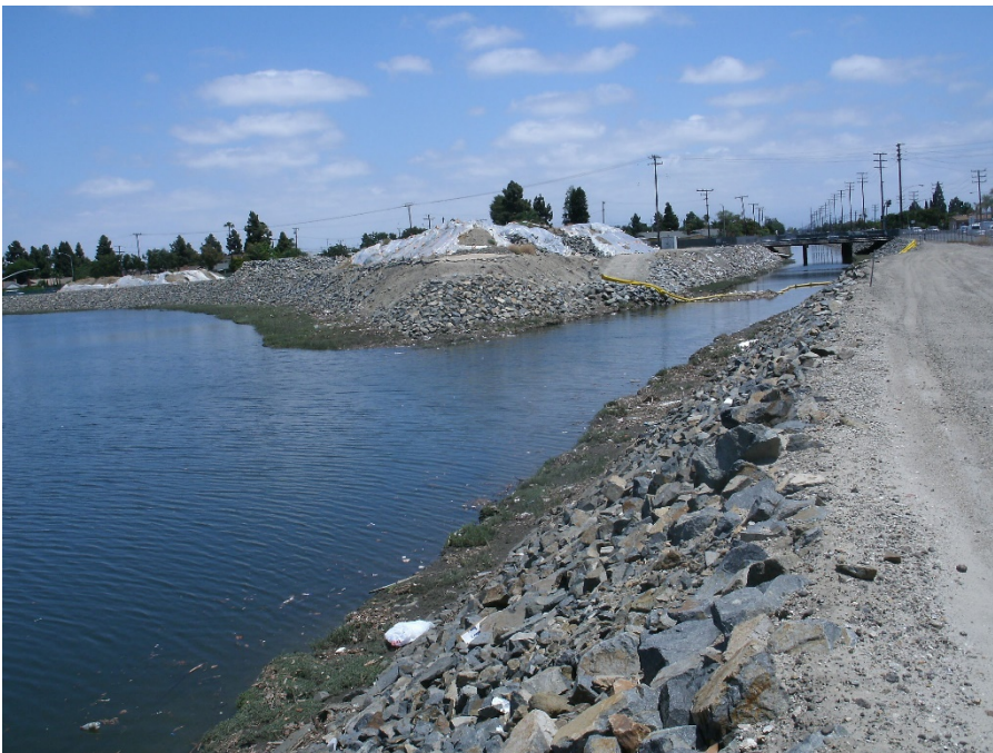
Photo 6: Facing upstream at diversion from C02 Reach 23 toward C02 (left fork) and C04 (right fork).