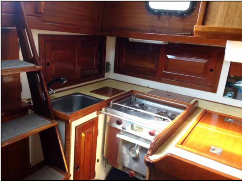
Left: Galley Below: Navigation Station