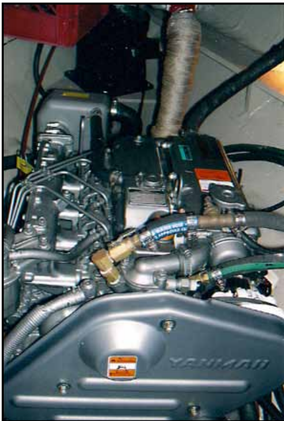
Yanmar 4JHE - 54 HP Diesel Engine