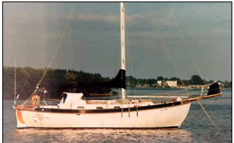
A Wonderful Boat to Live Aboard or Cruise