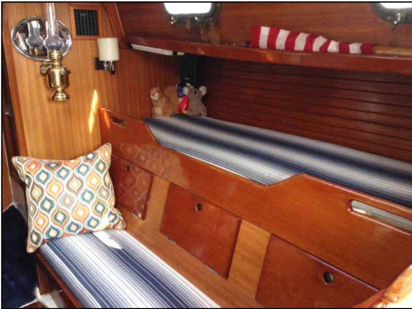
Left: Pilot Berth