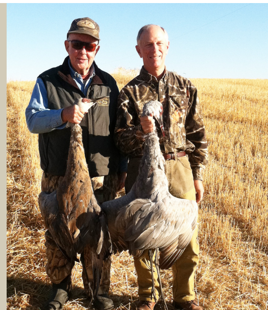
Hazard and Deke hunting sandhill cranes in Saskatchewan.

June 20–22, 2012 Vancouver, British Columbia