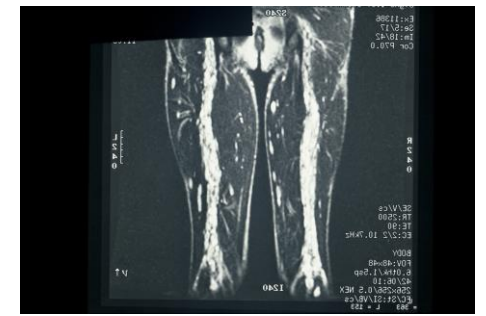
MRI of nodular neurofibromas of the sciatic nerves of both legs. The white lines are the sciatic nerves and they have clusters of growths or nodules/tumors along the nerves.

Plexiform neurofibromas often involve the nerves coming off the spinal cord. They can also involve large nerves like the sciatic nerve of the leg. They tend to enlarge or thicken the nerve that is affected and sometimes appear to produce little clusters of tumors along the nerve. We call this type of plexiform neurofibroma a nodular plexiform neurofibroma . The picture on the right shows the legs of a patient. There are a number of small white spots in the leg that are intramuscular plexiform neurofibromas and two long white cord like structures that are the sciatic nerves. The sciatic nerves are thick and have a cluster of tumors along them.