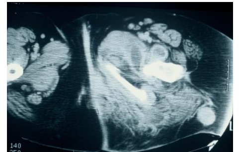
MRI looking down through the legs of a patient with a diffuse plexiform neurofibroma of one leg.

Below is an MRI through the legs of a patient with a diffuse plexiform neurofibroma of one leg. You can see how one leg is bigger (the right side of the picture) compared to the other leg and how the muscle fibers (the light colored areas) are not as dense because they are teased apart by the plexiform neurofibroma, but there is no obvious tumor – no clear margins for what is normal and what is abnormal.