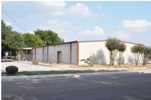
Former headquarters and future education center for The Caring Place at 2001 Railroad Street. Renovations are due for completion in Fall 2013