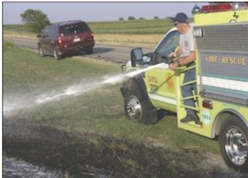
A small grass fire caused by a carelessly tossed cigarette can spark major problems in dry conditions.