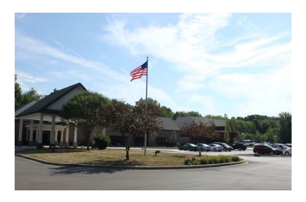
Link to Senior Clubs in Metro-Detroit <a href="https://www.seniorcenterdirectory.com/michigan/Detroit.htm">https://www.seniorcenterdirectory.com/michigan/Detroit.htm</a>