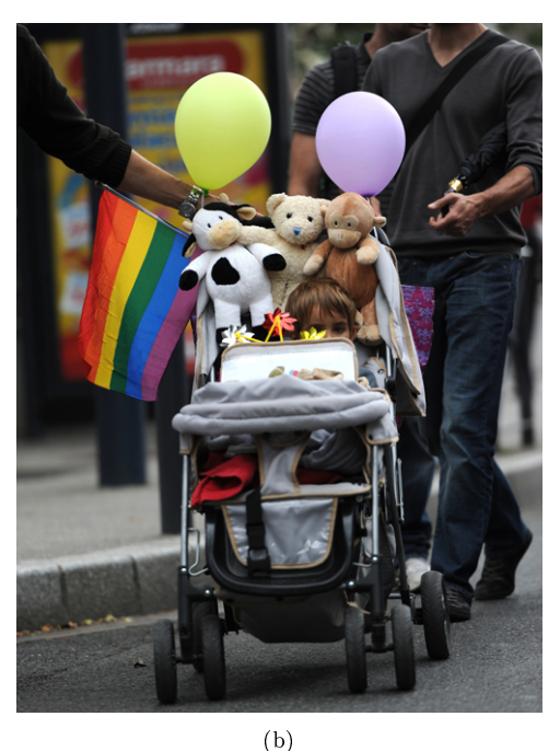
Figure 1: The modern concept of family is far more encompassing than in past decades. What do you think constitutes a family?