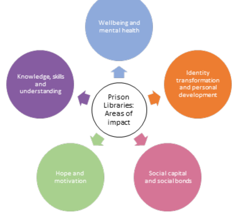
Figure 3. Areas of Impact of Prison Libraries (Prison Library Impact Framework, Finlay, 2018)