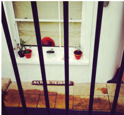
Nature can be nurtured anywhere.