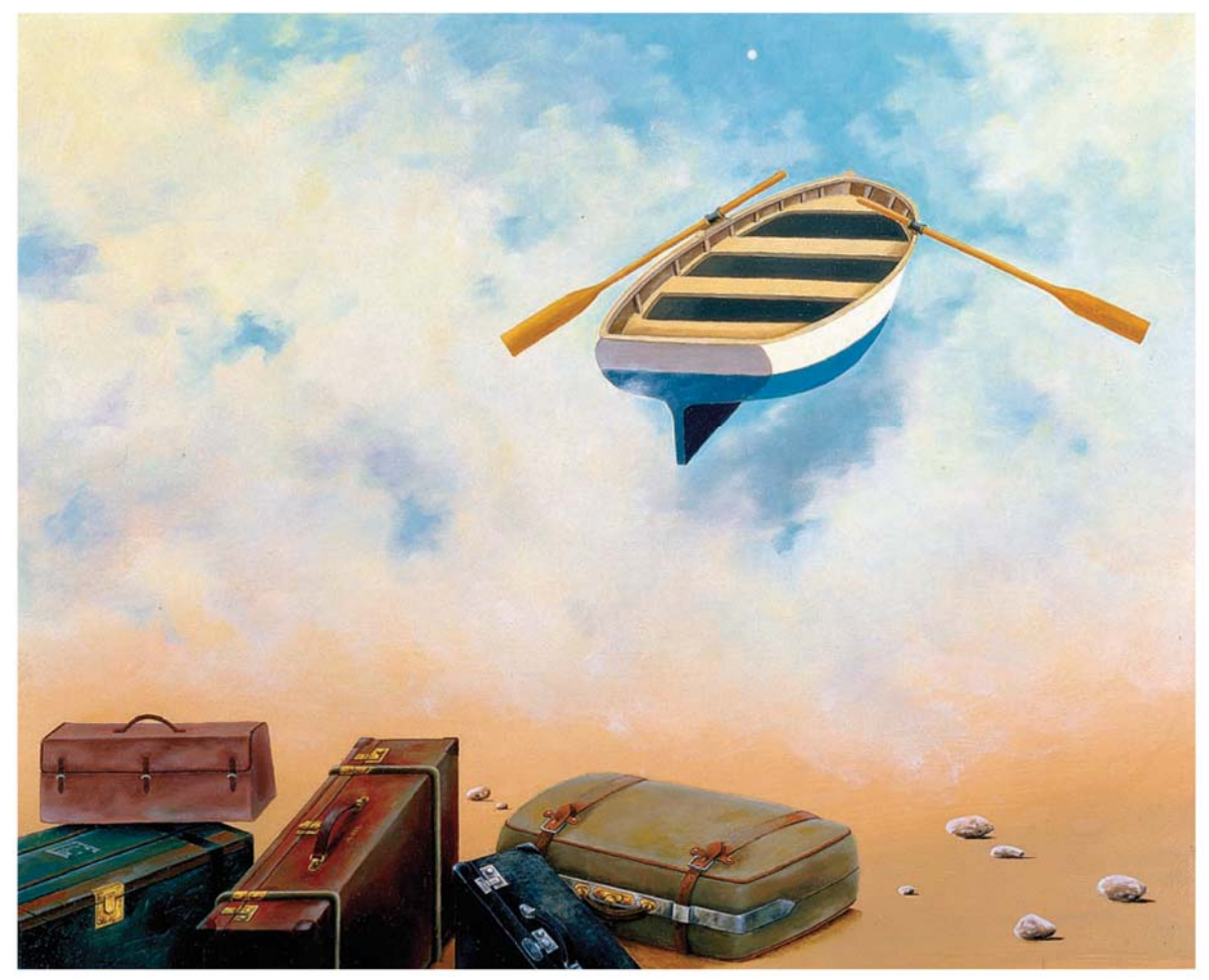
Utopie (1999), Bob Lescaux. Oil on canvas, 81 cm × 65 cm. Private Collection.

25 floating out, past the driveway, past the gates, in the black Ford, Papi grim at the wheel, winding through back roads, stroke by difficult stroke, out on the highway, heading toward the coast.