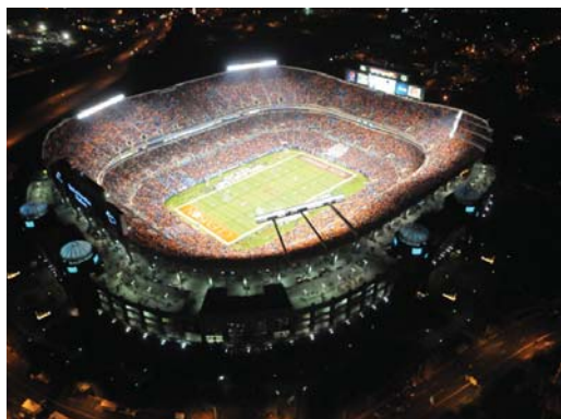
Charlotte's Bank of America Stadium