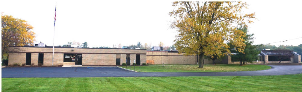
The Kiwanis Center

Interested in becoming a member? Please send an e-mail to MembershipGrowth@a2kiwanis.org or visit the website www.a2kiwanis.org .