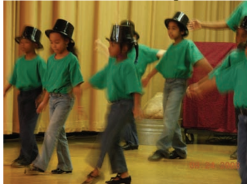
Hickory Hills Elementary School Arts Academy