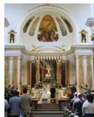
Cover: St. Peter's Italian Church, London, England