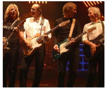
Status Quo, 7.30pm, £37.50. The Sage Gateshead, St Marys Square, Gateshead www.thesagegateshead.org

Little Angels, SKIN, Chrome Molly, 7pm. O2 Academy, Westgate Road, Newcastle. www.o2academynewcastle.co.uk