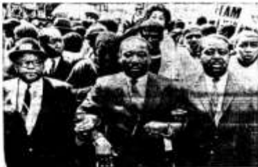
DR. MARTIN LUTHER KING JR. (center) with other leaders of the Memphis march on Tuesday, April 4, 1968. King was shot on the balcony of his hotel on the right.