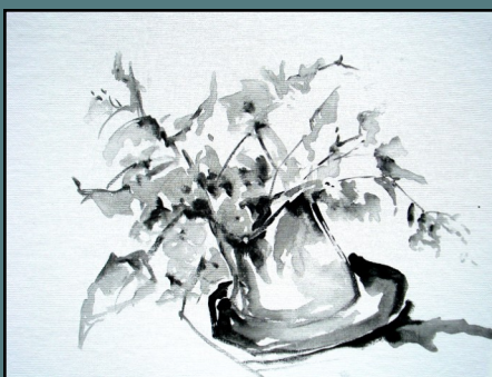
Black Flowers ~Terry Brooks