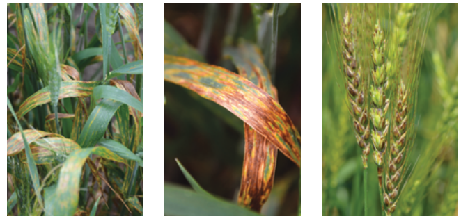
Bacterial leaf streak symptoms

Caused by: Xanthomonas tranclucens pv. undulosa Disease period: Flag leaf Occurrence: Widespread Impact on yield: Low to moderate