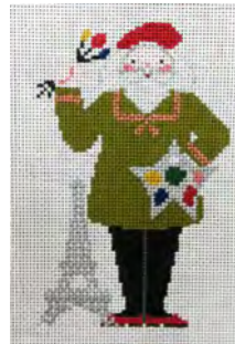
Parisian Santa Petei (Painted Pony) $40. 00