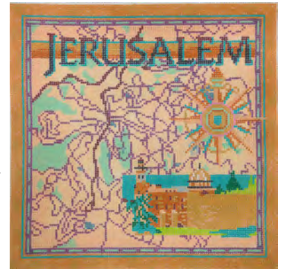
Jerusalem Map Ruth Schmuff $126. 00