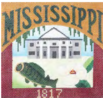
State Postcards Denise DeRusha $59. 00 each