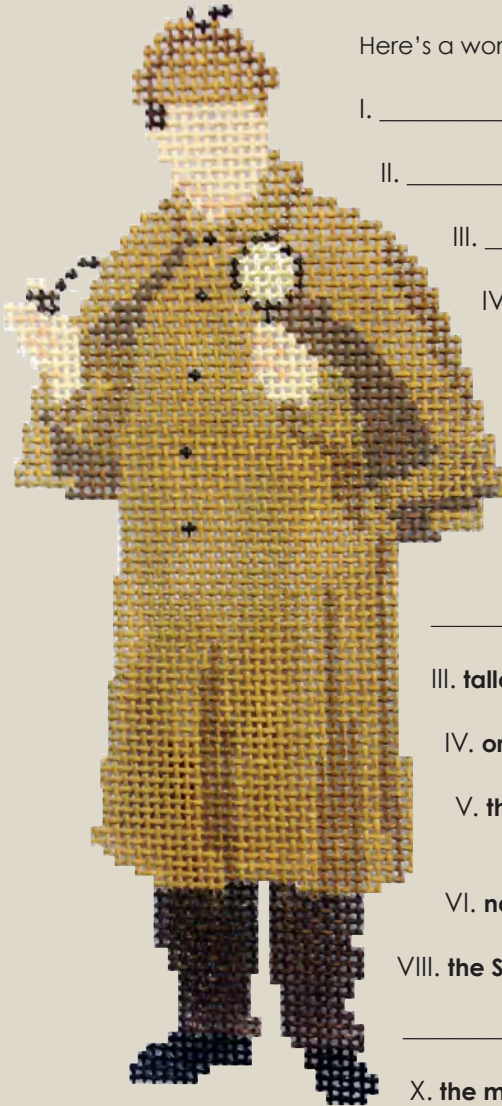
Sherlock Stand-Up by Rogue Designs 18m 2.75 x 5.5 $30.00

Here's a worksheet to jot down your answers to our clues about Amy's 12 destinations: