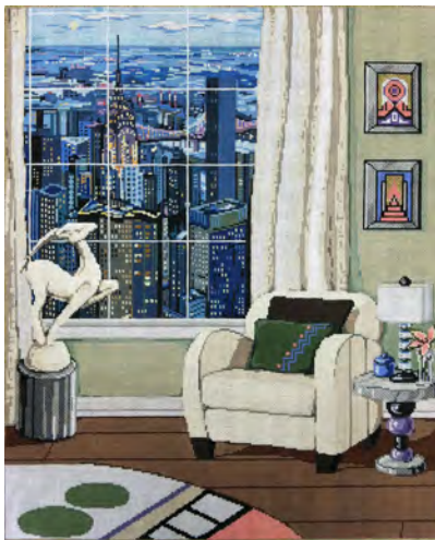
Manhattan View Fleur $315. 00