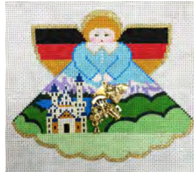
Germany Angel Painted Pony $70. 00