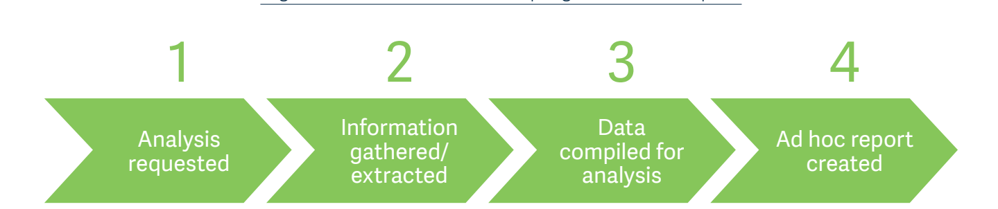
Figure 2: Process for developing an ad hoc report

Real-time reporting has evolved to fill in the gaps created by these time lags and supplement the content of standard financial reports with operational data. Ad hoc reporting often follows a process as depicted and described in Figure 2.