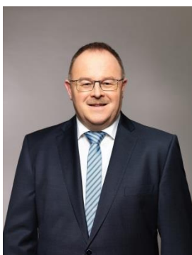
Mr. Romain Schneider

Minister of Social Security, Sport, Development Cooperation and Humanitarian Affairs