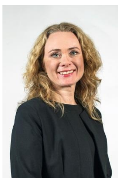
Ms. Anniken Hauglie