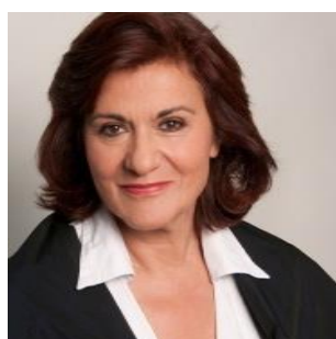
Ms. Theano Fotiou

Alternate Minister of Labour, Social Security and Social Solidarity