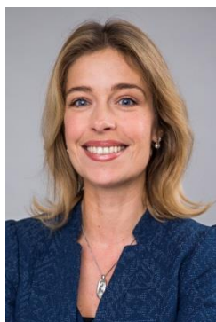
Ms. Annika Strandhäll