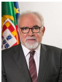
Mr. José António Vieira da Silva

Minister of Labour, Solidarity and Social Security