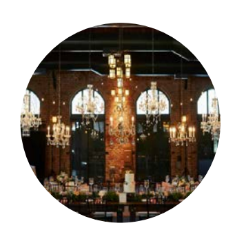
MINNEAPOLIS • MINNESOTA 600 SEATED • 5.000 MINGLING