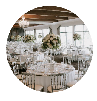
BROOKLYN PARK • MINNESOTA 300 SEATED • 500 MINGLING