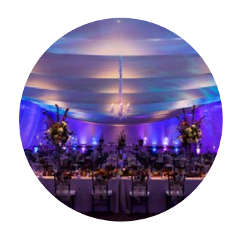
INWOOD OAKS SAINT PAUL • MINNESOTA 1,000 SEATED • 1,500 MINGLING