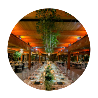
A'BULAE SAINT PAUL • MINNESOTA 465 SEATED • 465 MINGLING