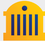
Government & Tax