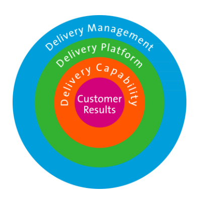
The Avanade Delivery Model

Avanade understands these business imperatives and offers new levels of innovation combined with a unique delivery approach