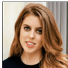
HRH Princess Beatrice

Meet these storytellers, and many more, on our website .