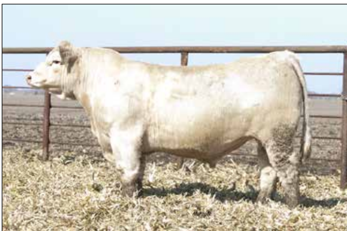
WIA Resource G61 – Son of Lot 13