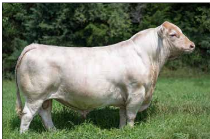
ACE Mr Mo Bob 3809X – Sire of Lots 29 & 31.

The first of two nice ACE Mr Mo Bob daughters that are making some nice milking females. This one is out of a Sonderup bred sire SCR Bronco 9026 that Wild Indian and Lindskov-Thiel purchased a few years back together and has done a nice job.