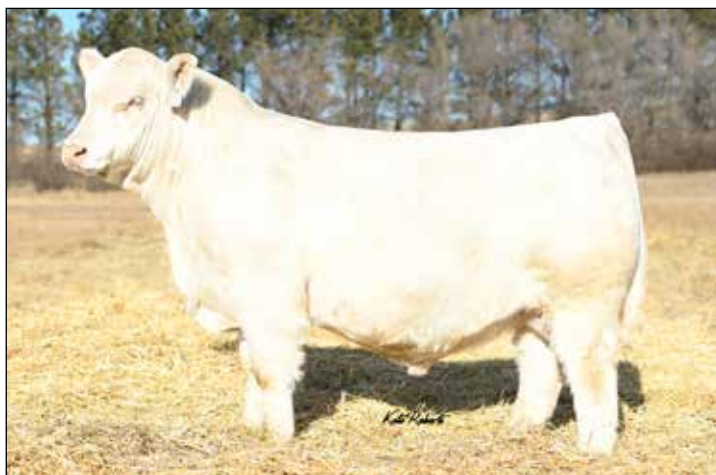
LT Atlas 0251 Pld – Service Sire for Lots 64, 65, 66 & 67.

This WC Milestone will impress those that come to the sale. Her Eggleston bred dam has produced them three daughters, one a 2019 WC Milestone that they love and another daughter sired by Mo Bob that is a spring 2021 baby now that looks great.