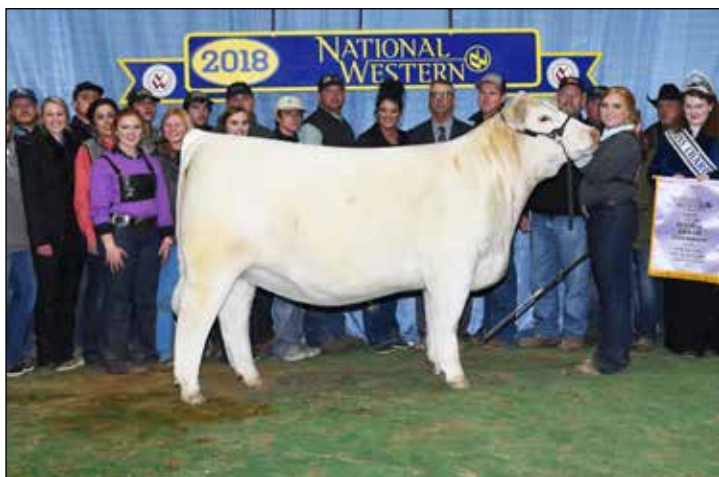
BRCH Dory 6501 – Dam of Lot 6

If you're looking for a spring heifer calf to drag into the show ring, stop right here! This exhilarating show heifer will get it done for you. Sired by M&M Outsider 4003 Pld will only keep your blood pumping as you consider this heifer as his daughters have won more National Championships than any sire in breed history. Then look at the maternal side of this pedigree and don't put on the brakes, Thomas Ms Impressive 0641 has produced more National Champion daughters than any dam in the breed history!