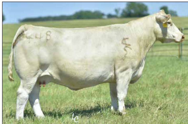
WCR Ms Paul 448 – Dam of Lot 25 & 27.