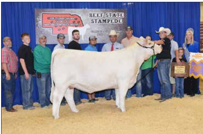
WIA Ms Celine Pld – Dam of Lot 8

Presented by Carr Cattle Company & Wild Indian Acres