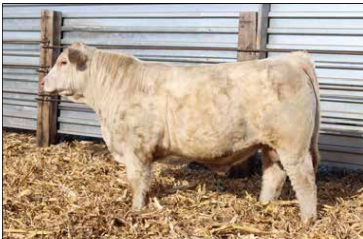
EC Front Line 734 Pld – Service Sire for Lots 28, 30, 31, 32 & 33.