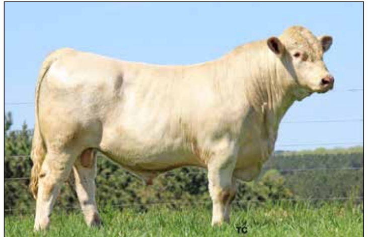
FTJ Monticello 1806 – Son of Lot 3

Presented by Cannon Charolais Ranch & Wild Indian Acres