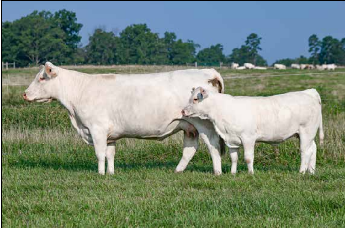
Lot 43 & Lot 43A