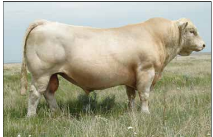
LT Blue Value – Sire of Lot 3