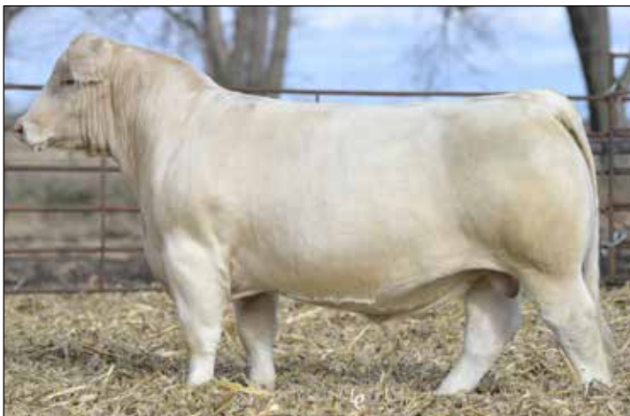
WIA Rebar G90 – Service Sire to Lots 43, 45, 47 & 50. Sired by Resource and out of Dory 6501, BW: 73 lbs. AWW: 928 lbs.

Lot 44A - Polled heifer calf #115, born: 3-7-21, BW: 80 lbs. sired by TR Mr Diablo 2742Z ET.