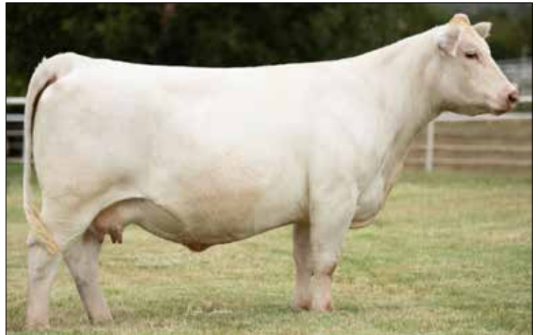
M&M Ms Watt 5054 Pld ET – Full sister to Lot 2