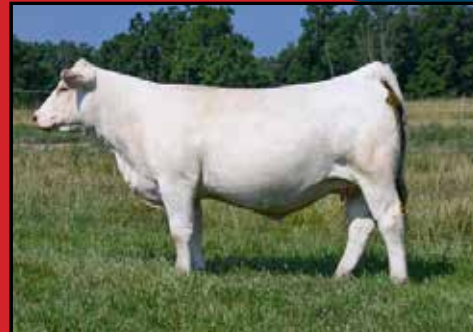
WIA MS MARY G62