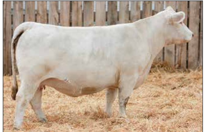
M&M Ms Carbine 1567 Pld – Dam of Lot 10 ETs