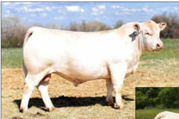
PUF Ridge 7142 – Sire of Lot 4

Selling One-Half Interest and buyers choice of the Spring or Fall Possession of either ET Herd Sire Prospect or Double your bid and take ¾ interest and full possession in one bull. Wild Indian Acres will retain a ¼ Semen Interest if that option is taken.