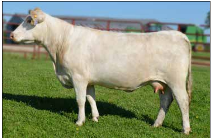
Mead Miss Benchmark 901 – Dam of Lot 43.

Lot 43A - Polled heifer calf #123, born: 2-28-21, BW: 67 lbs. sired by WR Foreman D602.