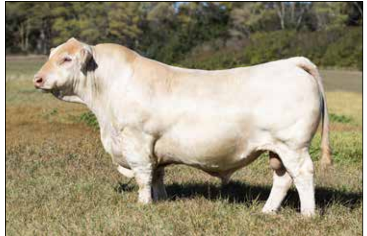
ACE-Orr Lock N Load 243 P – AI Service Sire for Lot 60.