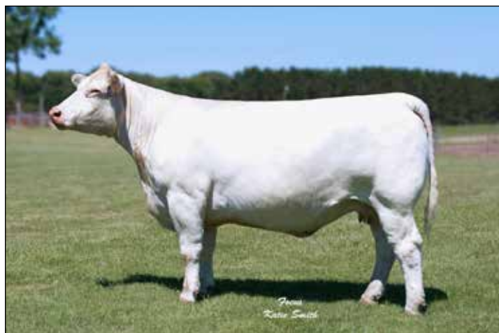
WDZ Skittles Pld ET – Dam of Lot 7