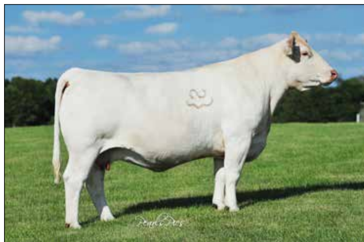
SCR Ms Turbo 7003 – Dam of Lot 14 & Granddam of Lot 15.

Due from December 10 through late February to WIA Rebar G90. Another fantastic daughter of SCR Ms Turbo 7003. This calf out of WIA Rebar G90 who is sired by Resource out of the $100,000 Dory will be a great one! A daughter of this female sells in the Spring Cow/calf Pair section as Lot 44. This cow family is maternally powerful.