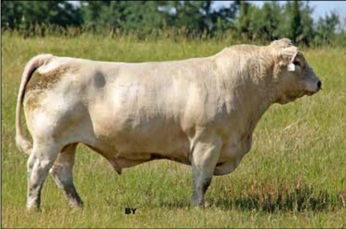
WC Doubletree 2109 Pld – AI Sire for Lots 68, 69 & 70.