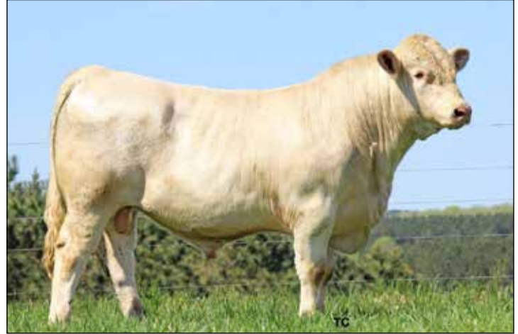
FTJ Monticello 1806 – Service sire for Lot 59