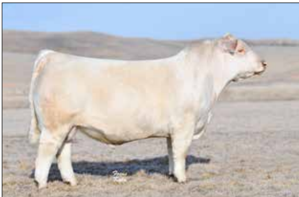
TR CC Deliverance 7974 Pld ET – Service Sire to Lots 53 & 54.