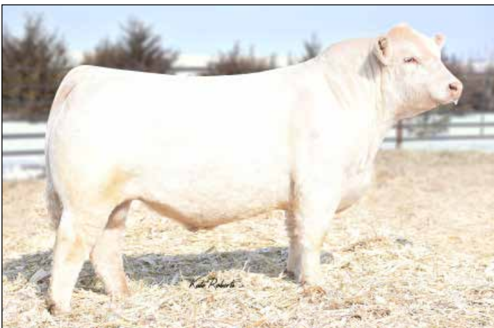
TR CAG Carbon Copy 7630E ET – AI Sire for Lot 71

Presented by Gillig Genetics & Carr Cattle Company