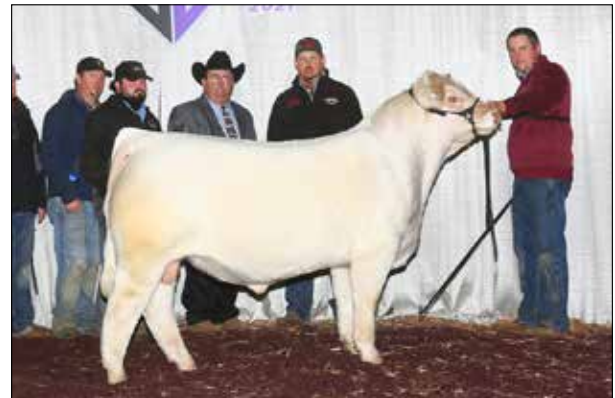
WIA Backwater Jack 060 P – AI service sire to Lot 55