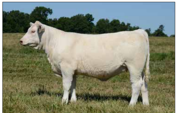
WIA Ms Sophia E01 – Dam of Lot 9 as a weaned heifer calf.