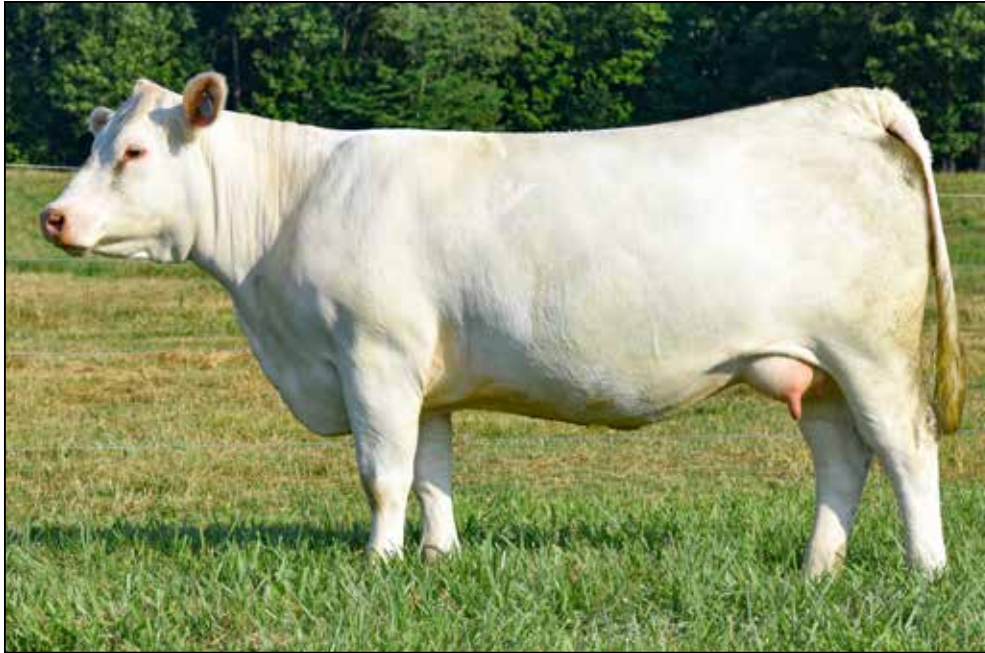
WIA Ms Its My Time P ET – Dam of Lot 50