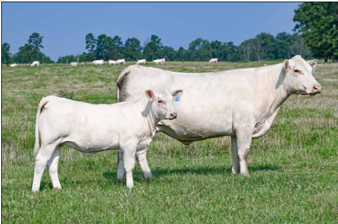
Lot 45 & 45A