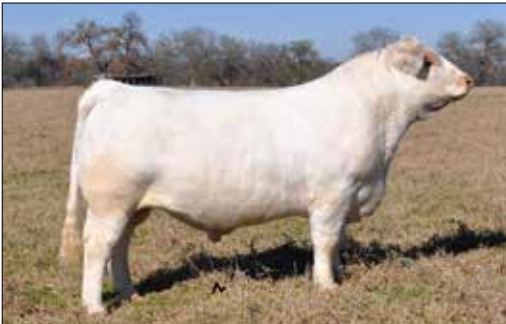
BJCF Watt Z36 – National Champion Sire of Lot 2