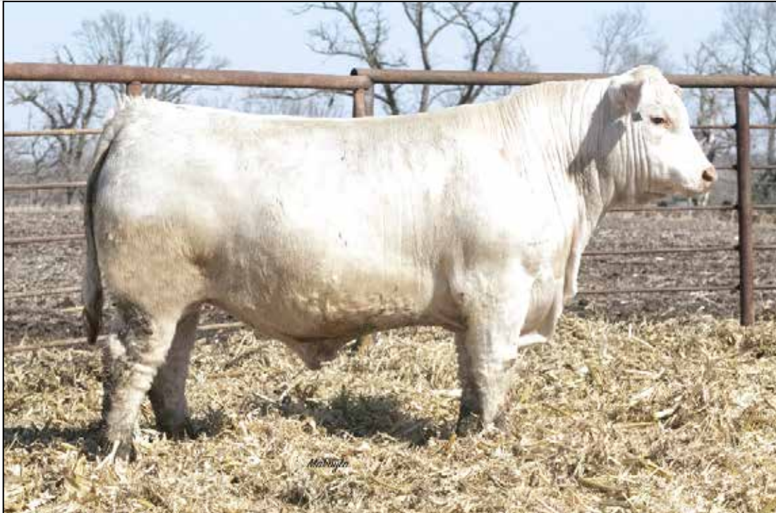
WIA Mr Bob G89 P – Maternal brother to Lot 16