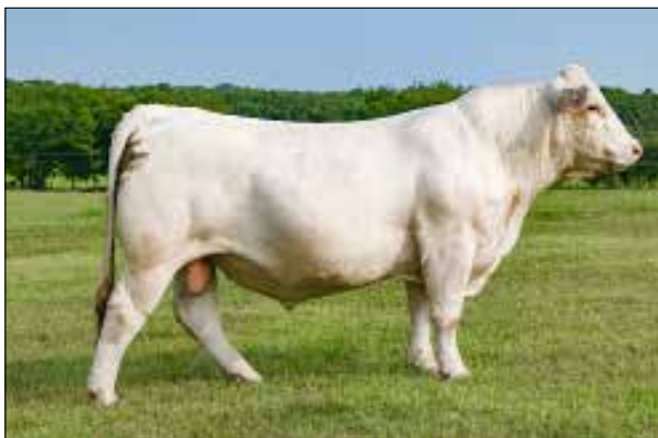
WDZ Phenom 839 – Sire of Lot 56A

Presented by Wild Indian Acres & Wright Charolais