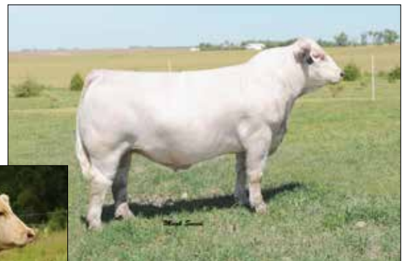
TR Rhinestone Z38 – Sire of Lot 5

Two exciting herd sire prospects sired by two of our breed's top sires and both out of the highly proven OBG Elvira 4303 Pld who has 110 progeny already registered at AICA. In the last Wild Indian Acres Female Sale last fall, two heifer calves sired by M&M Outsider 4003 out of OBG Elvira 4303 sold for $16,500 and $20,000! These two herd sire's prospects sired by Ridge and Rhinestone will be no less exciting!