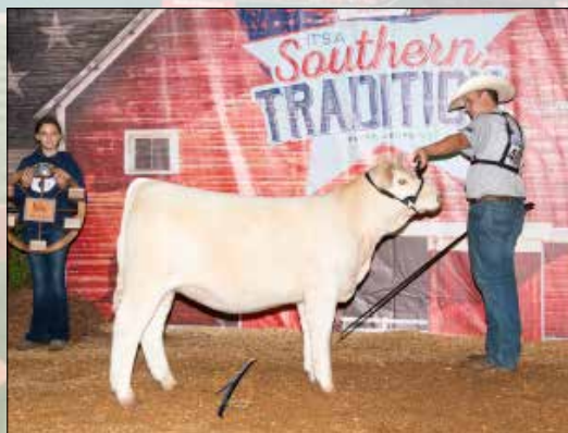
WIA Ms Abbie P132