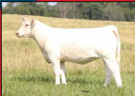
WIA MS SKITTLES 120

Join us September 18, 1 p.m. at the Ranch!