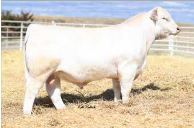
GHC Reagan 9012 – Sire of Lot 10 ETs

Selling One-Half Interest & Full Possession in Buyer's Choice of ET's! The buyer may select a bull calf or heifer calf.