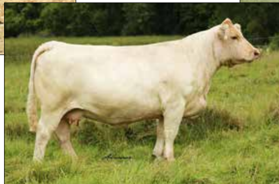
OBG Elvira 4303 Pld – Dam of Lots 4 & 5