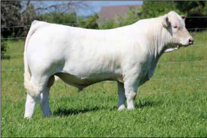
WIA-Conley Insider D9 P – Sire of Lots 68 & 69