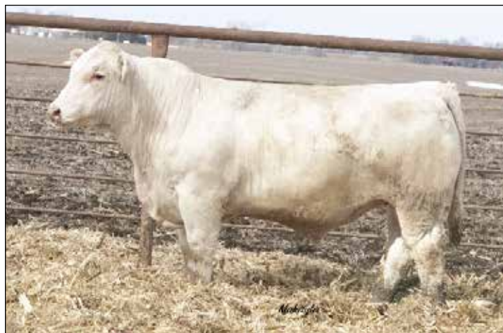
WIA Mo Bob 050 Pld - Son of Lot 45

Lot 45A - Polled heifer calf #156, born: 3-16-21, BW: 76 lbs. sired by WC Milestone 5223 P.