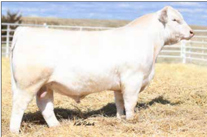
GHC Reagan 9012 Polled – Service Sire for Lot 62 & 63.