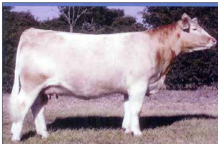
DA Ms Marion 328 P ET – Dam of Lot 48 and Lot 49

Lot 48A - Polled bull calf #114, born: 2-26-21, BW: 84 lbs. sired by WIA-WC Linebacker E121.