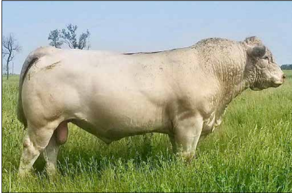
JMAR Benaiah 1E66 – AI Service Sire for Lots 57 & 58