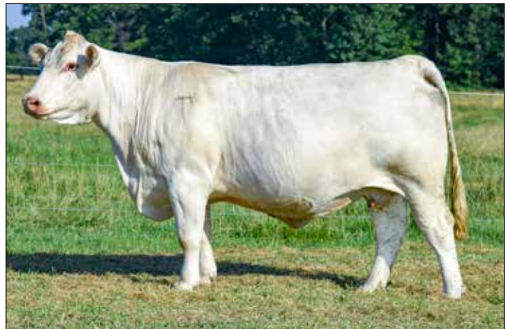
ACE Ms New Wienk 325 – Dam of Lot 62.