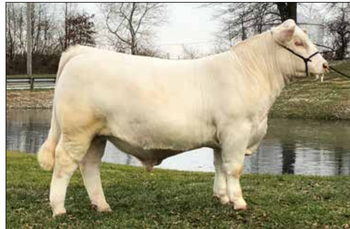
LHC Blue Dog 7043 Pld – Service sire for Lots 72 & 73.