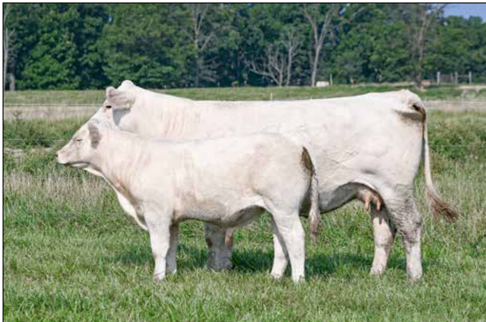
Lot 47 & 47A