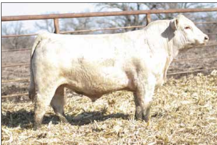
WIA Mr Foreman G73 – Son of Lot 18

Here is an ET daughter of another super producing donor P125! Her first calf, a son born 9-19-19 was a stud in the last Wild Indian Acres Bull Sale selling for $4,750 to Texas. Her next bull calf born 10-1-20 will be another stud in the 2022 WIA Bull Sale.