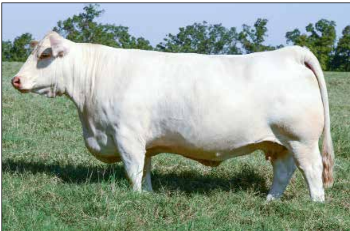
M6 Ms New Jewel 0155 Pld – Dam of Lot 1

WR Foreman D602 x M6 Ms Sun Jewel 5117 P ET.