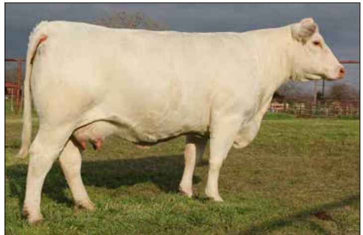
M6 Ms 761 Nancy 6100 P ET – Dam of Lot 53