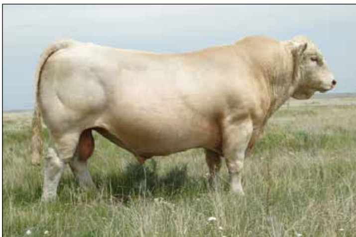
LT Blue Value 7903 – Sire of Lot 19

This good LT Blue Value daughter will open a few eyes around the display pens. Her calving interval has been impeccable, gaining ground every step; 9-18-16, 9-10-17, 9-2-18, 8-20-19 & 8-8-20. Hopefully will have an LT Authority 7229 AI calf, but if not her calf out of Bulls Eye, a WC Total Rush 3044 son should work well too.