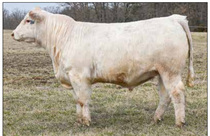
WIA High Voltage 005 Pld - Son of Lot 52

Lot 51A - Polled bull calf #118, born: 3-1-21, BW: 81 lbs. sired by WIA-WC Linebacker E121.