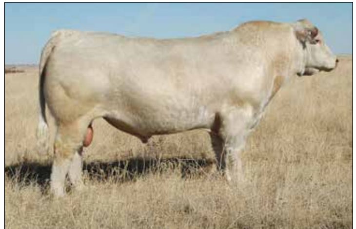
LT Long Distance 9001 – Sire of Lot 60 & Grandsire of Lot 61.