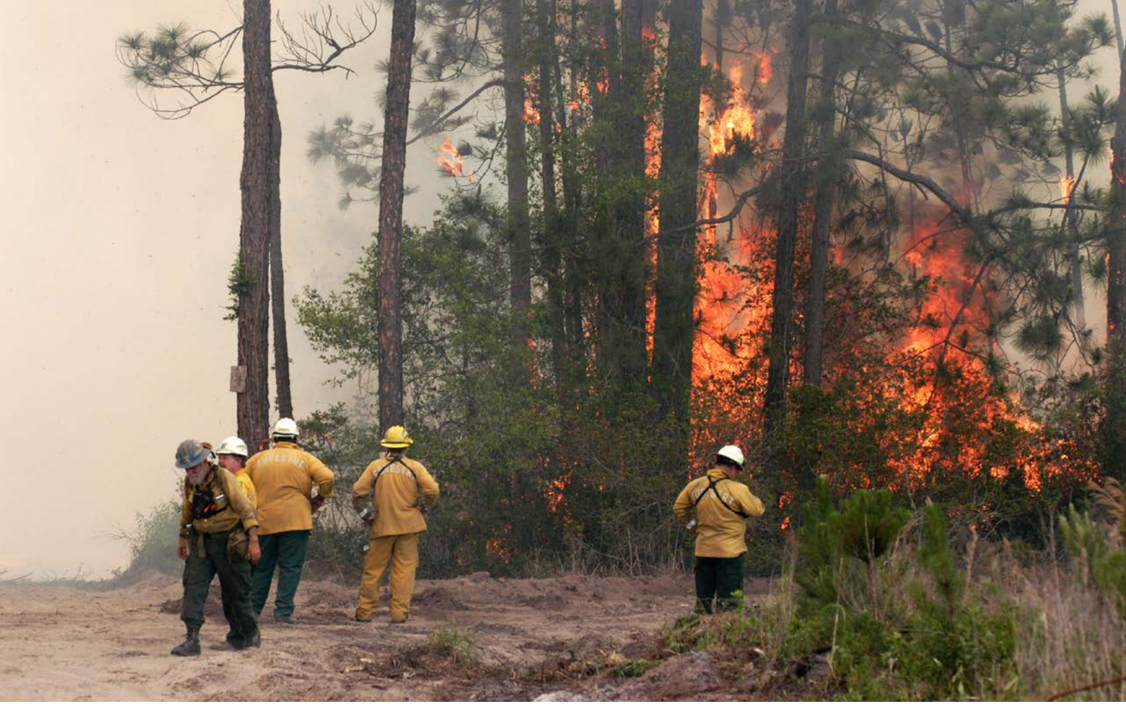
System Assessment and Validation for Emergency Responders (SAVER)