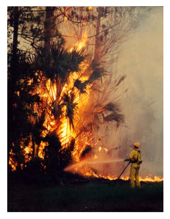
Figure 2-1. WLFF

The configuration of a WLFF PPE garment system plays a major role in the performance of the system<sup>2</sup>. Federal agencies (e.g., USFS, Department of Interior – Bureau of Land Management, Bureaus