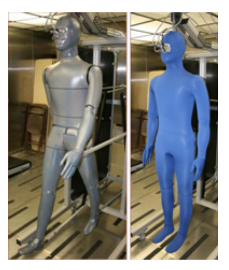
Figure 2-2. Sweating Manikin

System level testing consists of testing an instrumented manikin with the complete PPE ensemble and provides a better indicator of how garment design and the layering of multiple fabrics influence overall garment performance. Instrumented manikin testing (e.g., PyroMan<sup>TM</sup>) has been developed to determine the level of protection a garment system provides when the PPE system is subjected to a uniform and repeatable flame threat (Figure 2-2). However, due to the high intensity, short duration heat exposure, this system testing is more applicable to structural firefighting than wildland firefighting. Sweating manikin testing has also been developed to measure the insulation and evaporative resistance of a complete PPE ensemble. In principle, the sweating manikin is similar to the sweating hot plate, which is used to determine the insulation and evaporative resistance of a fabric; however, sweating manikin testing considers a complete garment system configuration and measures the THL of a garment system, not just the garment's fabric.