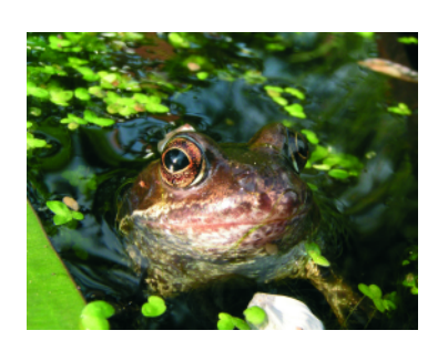
frog - R. Burkmar

Of the different pond types, garden ponds are most similar to freshwater ponds and they can provide a refuge and home for many freshwater dwellings creatures. A wildlife pond is one of the single best features for attracting new wildlife to the garden and it is thought that some amphibians, such as frogs, are now more common in garden ponds than in the countryside. Many pond creatures will travel far and wide to find new ponds, discovering a potential new home in no time at all. So a well designed wildlife pond can play a big part in helping to preserve our natural biodiversity, as well as being an attractive garden feature.