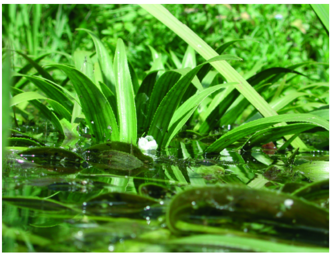
water soldier - RP

Plants suitable for each zone, and plants to avoid, are listed below: