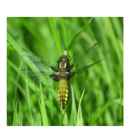
dragonfly - Wildstock