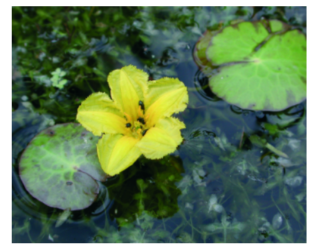
fringed lily - RP