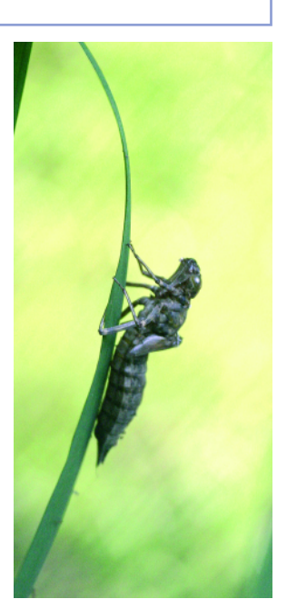
dragon nymph