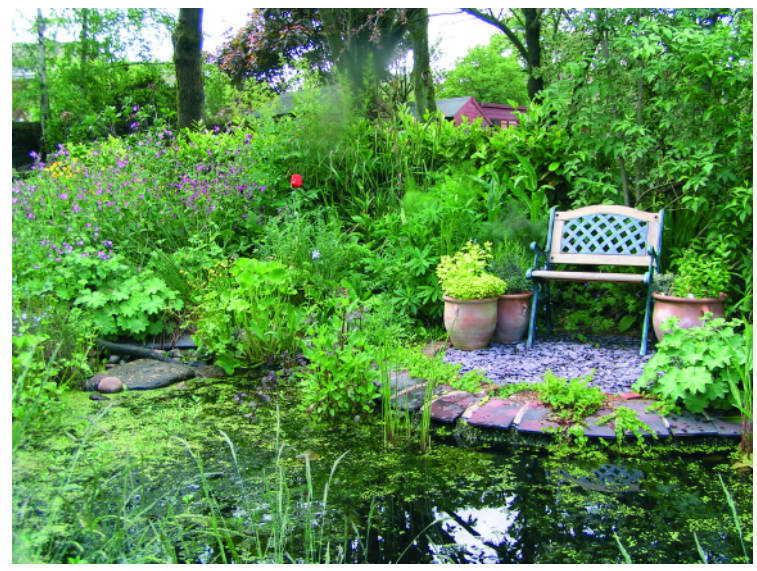
garden pond - R. Burkmar

Introduction Designing the pond Building the pond Choosing pond plants Pond open for business - attracting wildlife Maintaining your pond and Troubleshooting Further information