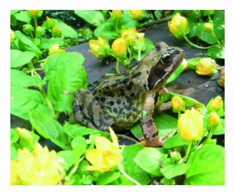
frog in creeping jenny - R. Burkmar

Important a wildlife pond should NOT have any fish, nor pumps, filters or fountains. Fish will eat all the other wildlife; pumps will suck in and destroy all the smaller creatures that other wildlife depends upon for food.