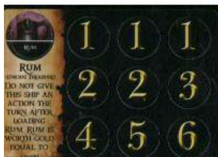
Front of T-005 Rum

Only six unique treasure cards would be included in our first set, only one of which, Rum , is really very useful. PSM has the lowest number of Unique Treasures of any of the sets WizKids has released thus far.