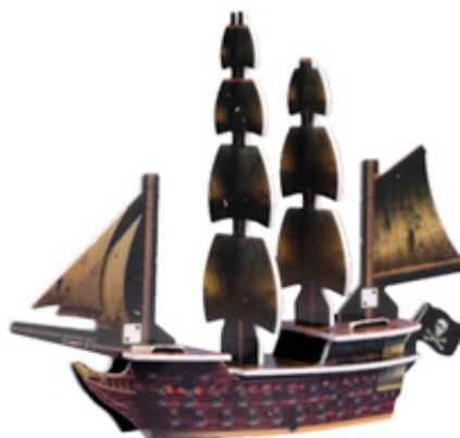
PS-011 The Darkhawk II

Naturally, some game pieces in these rarities are worth more than the above guide indicates. The Darkhawk II a Pirate ship with a VERY large cargo commands up to $7.00 in the secondary market, however, for the most part, most non-rare game pieces can be had for under $3.00 a piece.