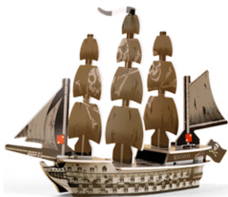
GS-001 Revenant LE

As prizes for winning and participating in approved play tournaments, WizKids gives out “Limited Edition” prize cards, or LEs. For PSM these were all reprinted ships and crew with alternate color schemes and flavor text. LEs are distributed singly sealed in a plastic baggie. Ostensibly they are all part of a fourth faction, the “Ghosts”, however, this faction has not actually been recognized as a separate playing group. All of the ships were available in the 2005 “Pirates Plunder” promotion, however, none of the crew or treasure cards have been made available outside of approved play tournaments. To add another wrinkle, the treasure coins are all printed with a silver obverse instead of the normal gold, meaning you cannot play with LE treasure, unless that is ALL you are playing with. These pieces have a limited collector value, as they are, for the most part, strictly reprints. However, as supply continues to diminish, and more collectors come to the game, prices will undoubtedly rise.