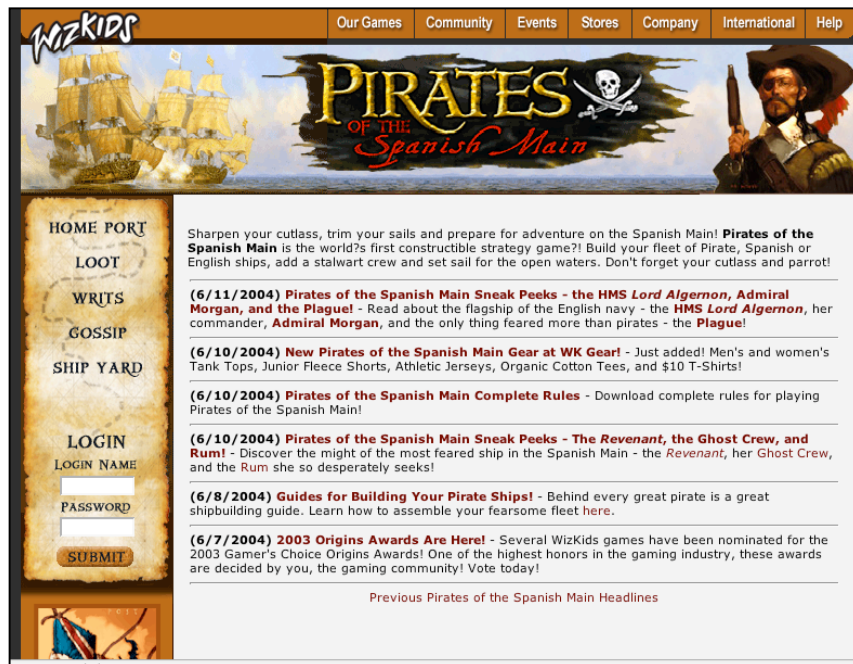
The original Pirates website, circa June, 2004.