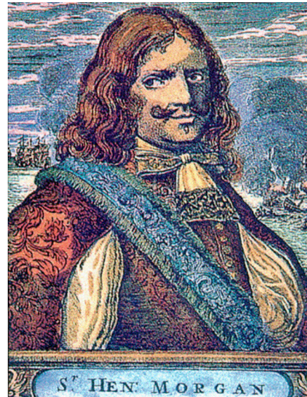
Sir Henry Morgan

Note: This scenario was originally designed to utilize game pieces from all of the Pirates sets up to South China Seas , however, it can be run with strictly PSM game pieces, with the exception of the Unique Treasure Explosives . That treasure’s ability says “When this ship rams an enemy vessel, roll D6. On a result of 5 or 6 both ships sink. Remove Explosives from the game”.