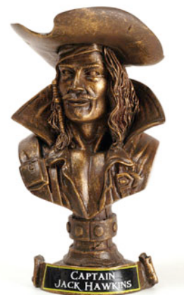
PP-390 Jack Hawkins