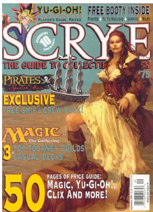
Cover for Scrye Magazine #75 - September 2004

After debuting PSM at Origins in June and staging successful "Blackheart's Wager" tournaments at Gen Con in July, WizKids finally released the game to retail stores on July 28 th , 2004. Within just a few months, two entire press runs were sold out, and a second, unlimited version would be released. The Unlimited set of PSM can still be found in stores more than 18 months after its' release. During the Summer of 2005 WizKids produced six gorgeous tins, each containing three packs of PSM and one pack of Pirate of the Revolution , all for $9.99. These tins are also still currently available.