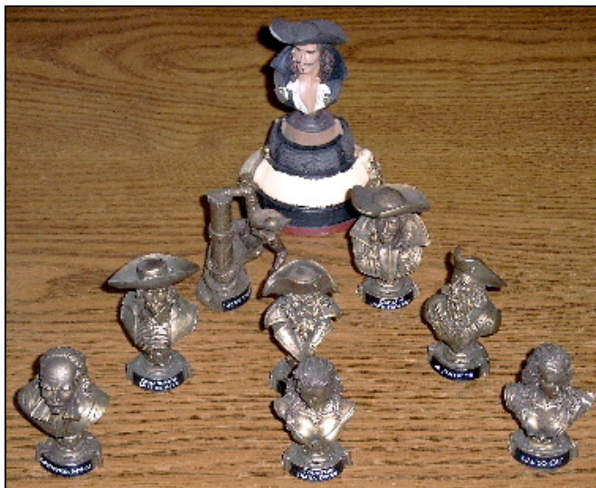
A complete set of all 8 busts, and the Advantage Trophy

As you can see, the prizes for these tournaments were incredibly cool, and valuable. The metal coins mentioned above ended up being salvaged from another game by another manufacturer, and are not considered a part of the PSM set. However, the busts given away are another story.