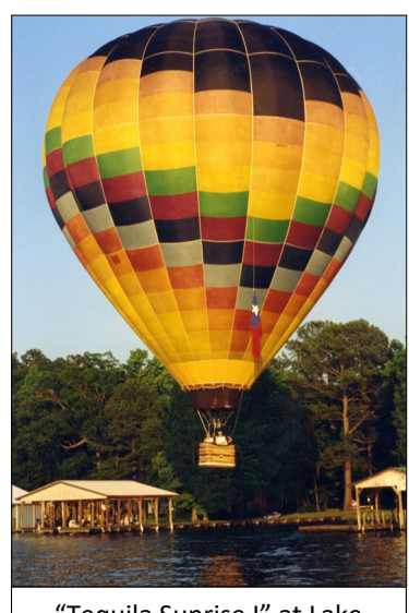
"Tequila Sunrise I" at Lake Cherokee in Longview, TX 2008.