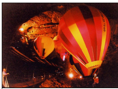
Inflating balloons underground at Marvel Cave Glow competition.