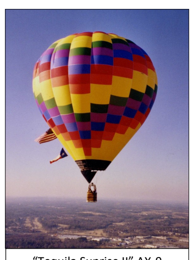
"Tequila Sunrise II" AX-9 140,000 cubic feet in 2013.