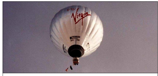
The Virgin Airlines balloon on a record flight from Texas to South Dakota.

*International Awards include Silver Badge and Gold Badge with Two Diamonds