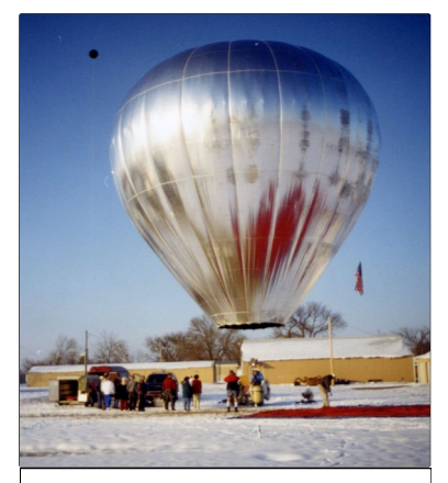
AX-6 World Record Duration flight from 1997 Okema, OK.