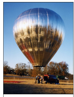
World Record flight AX-6 Chanute, KS to Savannah, GA 1995.