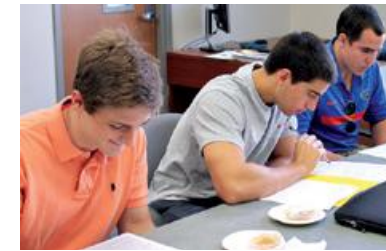
➤ MSF seniors helping juniors prepare for internship nomination at a weekend workshop.