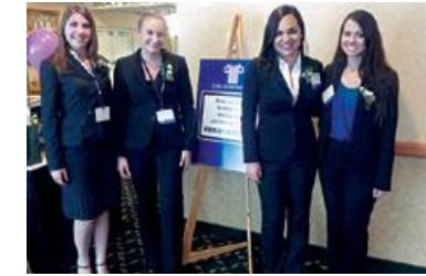
➤ Sophomore students attended the Florida Bankers Association's 2013 Women in Banking Conference.