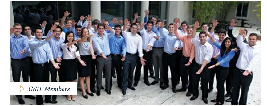
➤ GSIF Members