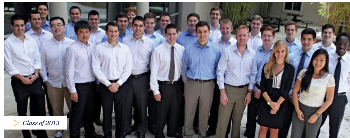
Class of 2013

$350,000 Annual Private Funding Need – $250,000 Endowment Income