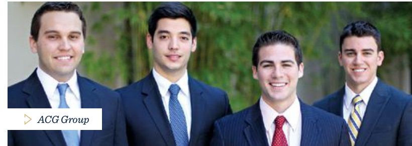
➤ ACG Group