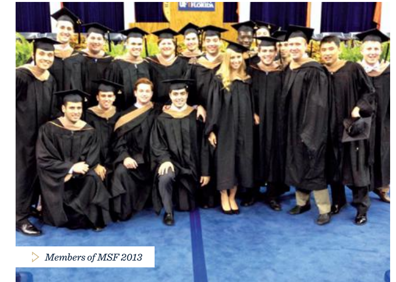
▷ Members of MSF 2013