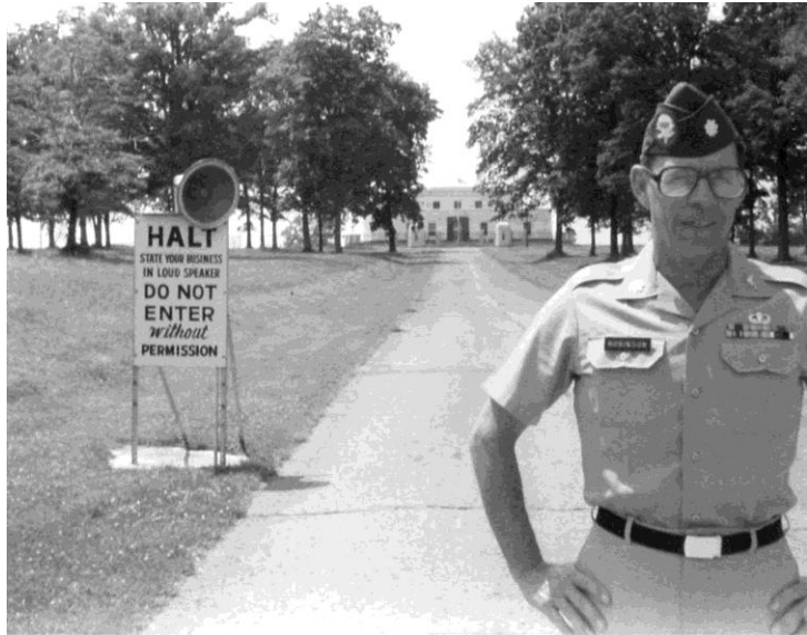
At Fort Knox