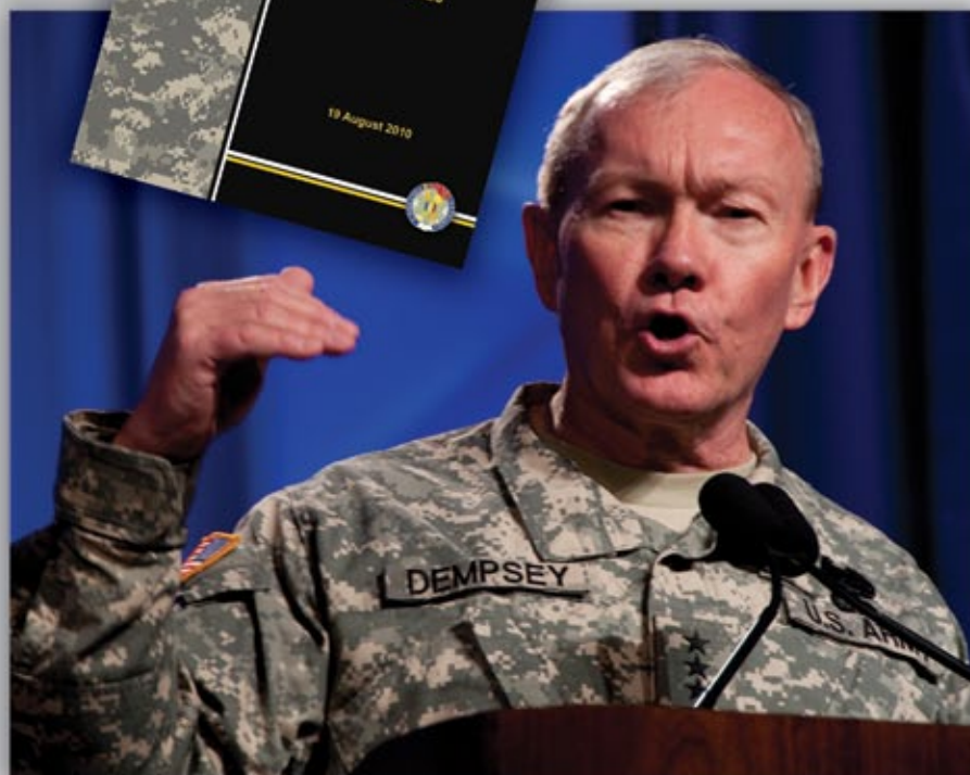
GEN Martin E. Dempsey, commanding general of Training and Doctrine Command (TRADOC), discusses The Army Capstone Concept and an enterprise approach to support training of a 21st-century Army during the 2010 Winter Symposium of the Association of the U.S. Army in Fort Lauderdale, Fla.