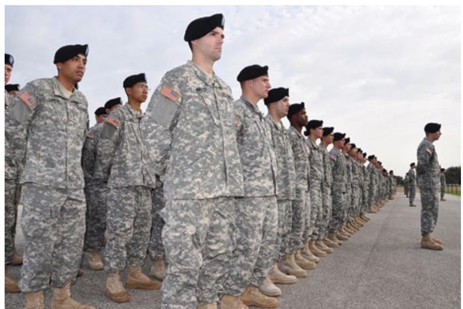
This year’s Basic Officer Leadership Course (BOLC) class of 482 students stand at parade rest during the graduation ceremony in July.

In order to fulfill the commitments we make to the nation in the Army concepts, we must develop our leaders. This summer I read a New York Times editorial by David Brooks titled “Drilling for Certainty” that described the events leading to the well explosion in the Gulf. He claims that a combination of failures led to the incident. On one level, it was a failure of processes and a failure of systems. He also implies, however, that on another level it was a failure of leader development. As he reports, corporate executives failed to recognize the conditions of increasing complexity in which their subordinates were operating. The act of drilling at 5,000 feet is exponentially more diffi-