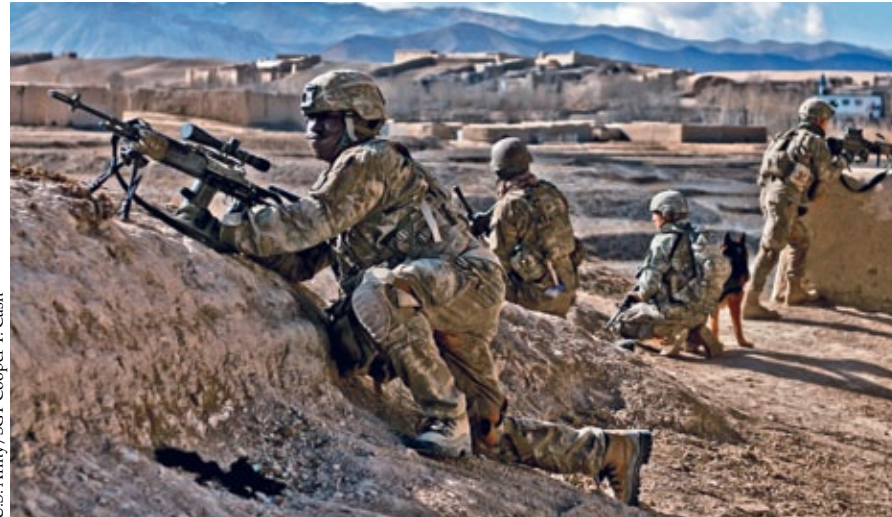
U.S. Army/SGT Cooper T. Cash

Second, commanders seek to “empower the edge” by pushing capabilities to the lowest level appropriate for a particular mission. Commanders at lower echelons require access to a wide array of capabilities (Army, joint, interagency, intergovernmental and multinational) to confront and solve complex problems. Army forces communicate with and integrate interagency, intergovernmental and multinational partner capabilities at the lowest practical echelon. In addition, Army leaders understand both the capabilities and limitations of partners in order to integrate them effectively in the planning and execution of operations. They must also be able to work collaboratively when necessary to leverage the capabilities of those actors who operate outside their direct authority and control.