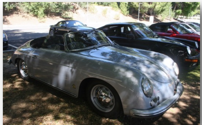
Porsche 356 on display at the CAI Concours

I have a never been installed kit (with AC). I paid $200 + and will sell for $100 + shipping. For more detail go to http://www.pedrosgarage.com/Site_2/TechnoPulley.html John Quick - Cal_inland Region - 661-878-1139 treasurer@cai.pca.org