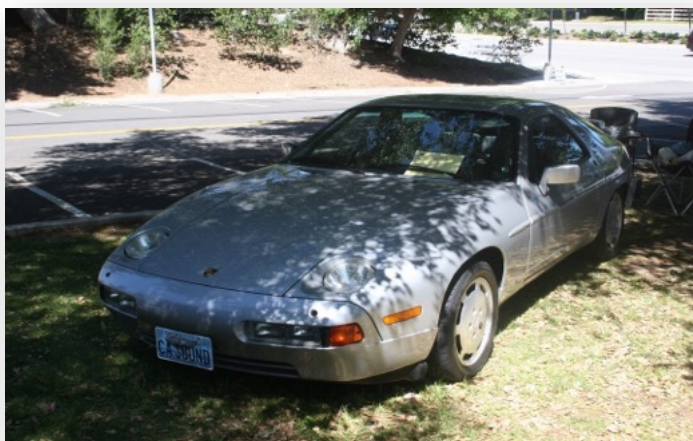
Porsche 928 on display at the CAI Concours