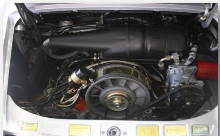
Porsche 911 engine on display at the CAI Concours