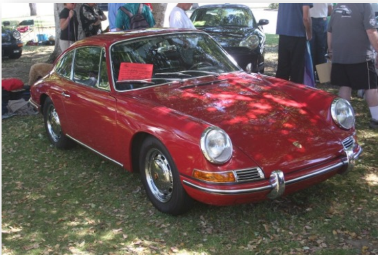
Porsche 911 on display at the CAI Concours

The meeting was adjourned at 1:07 p.m. 🚗