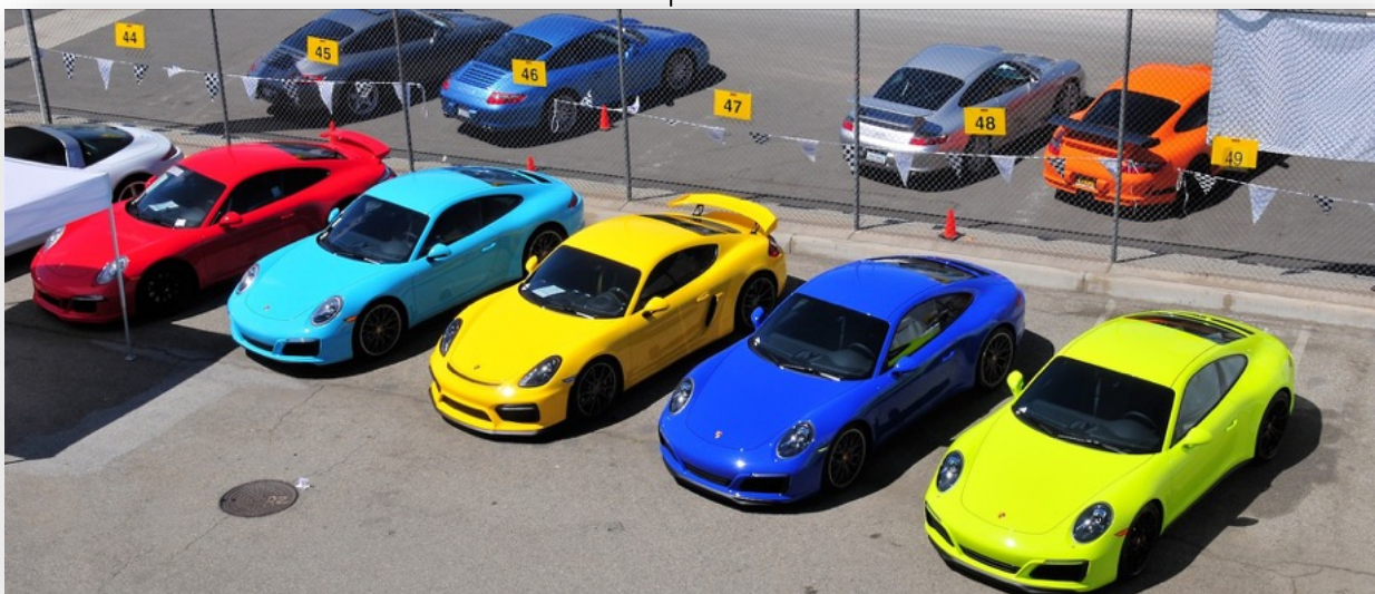
A row of Skittle colored Porsches at the California Festival Speed.

If you have any ideas or suggestions for events, do not hesitate to contact any of the board/committee members!!!