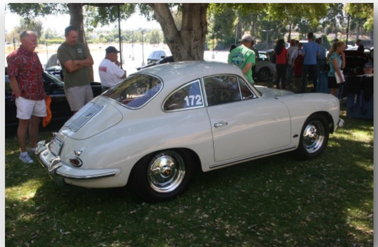
Porsche 356 on display at the CAI Concours