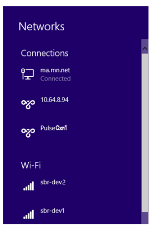
Figure 3: Windows Networks List with New Pulse Connection

Pulse connection prompts (Figure 4 on page 8) and messages (Figure 5 on page 8) appear as Windows user interface elements.