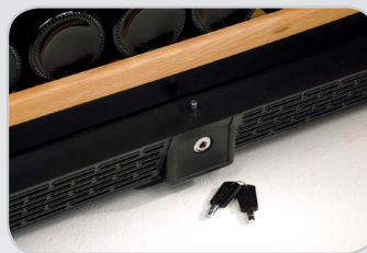
Lock fitted as standard