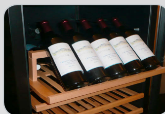
Optional presentation shelf