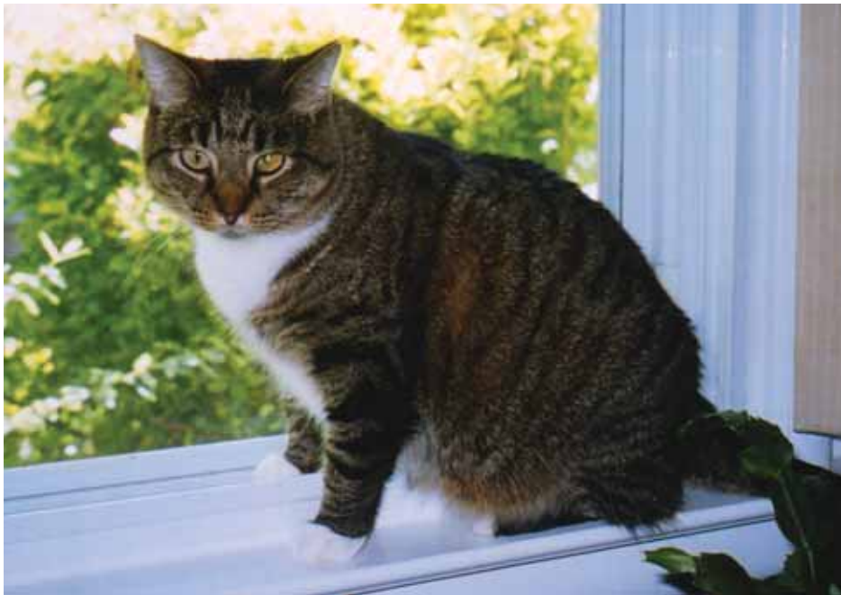
Penny, later renamed Simba, enjoys a leisurely afternoon in her new home.