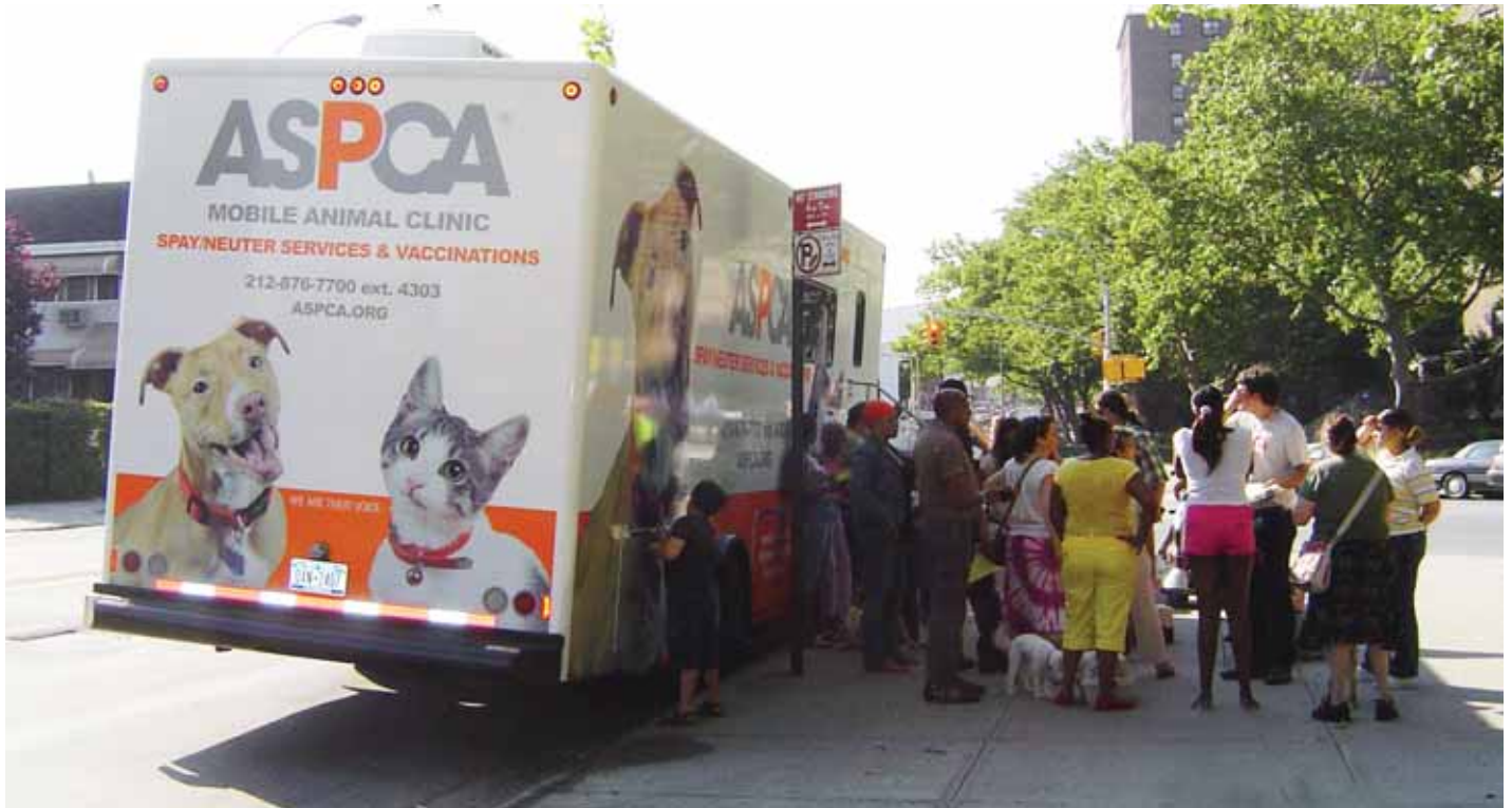
Community residents and their pets line up for low-cost services offered by the ASPCA's mobile animal clinic.