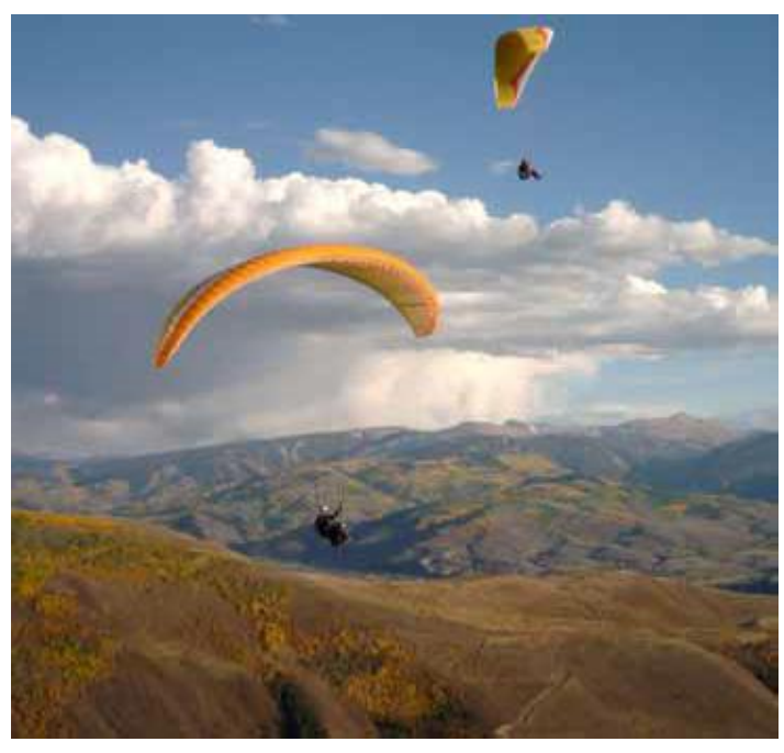
Dave soaring over Bellyache Ridge on a beautiful Fall day.

Be sure to stop by our Front Desk to say hello to Dave and hear about his latest high-flying adventure!