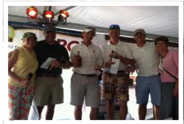
Congratulations to 1st and Main Investment Advisors, the 2012 tournament champions!