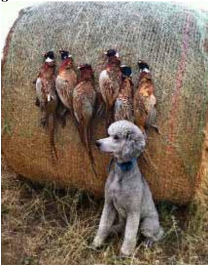
( CH Lemerle Silk Tie SH)

Many times they will pop up over the cover to get their bearings of where their hunter is, or better yet where a bird may be, they are also excellent at both ground and air scenting, working the wind in their favor to produce game.