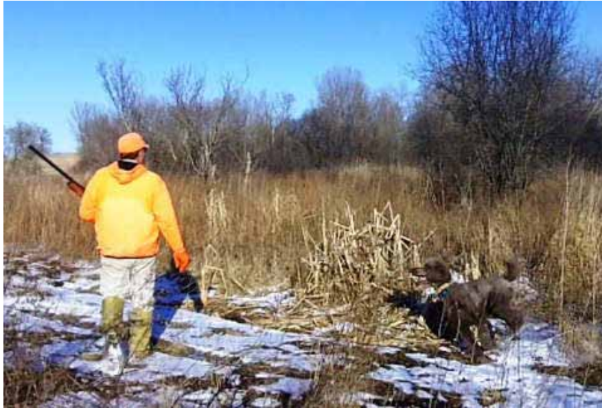
(Ch Autumn Hill Oakwind Express JH RE AX AXJ XF WC)

Hunting instincts and abilities are evaluated as the dogs find, flush and retrieve upland birds.