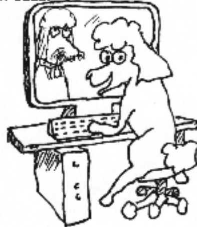
"I found my great-great-grandd!"