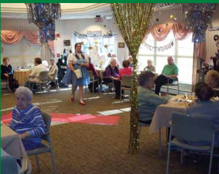
The room was set up night club style. Each Hollywood character passed out theme based goodies to every resident