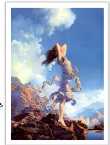
Ecstasy by Maxfield Parrish

A local fellow, Maxfield was born in Philadelphia, educated in the Haverford School, Drexel University and the Pennsylvania Academy of Fine Arts. At age 27 he illustrated a familiar book, L. Frank Baum's Prose of Mother Goose. However, he was mostly known for his distinctive saturated hues and idealized neoclassical imagery. He lived to be 95 years old.